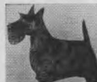
Ch. Mac R's Kiltan