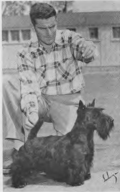
CH. O'DARBY'S HI-HOPE