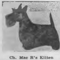
Ch. Mac R's Kitten