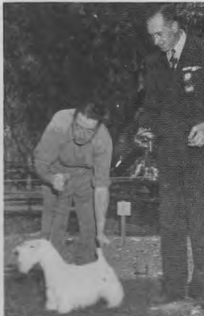
CH. LOVE'S TOP REWARD