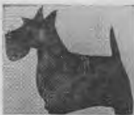
Ch. Mac R's Kliten