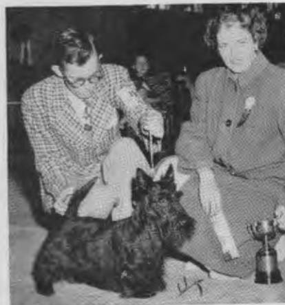
Best of Breed—Salt Lake City. PAISLEY HILL PIED PIPER

Bill Sykes of Coventry (A-934,722) Charl-Doro Wistful Charmer (N-53,806) Dickens' Elvinar's Anabelle (N-22,247) Fernstone Tam O' Shanter (A-935,594) Jingle Jangle of Bow-Bells (N-51,778)