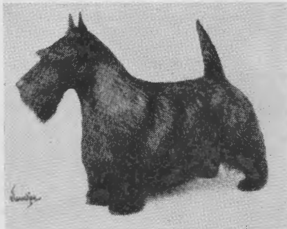
CH. DEEPHAVEN RED SEAL Recently purchased by Carnation Farm Kennels, Carnation, Wash.