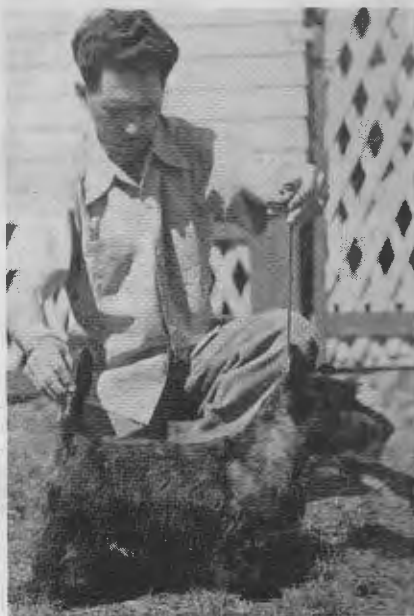
CAN. CH. HAIGSTOUNE BRINDLEBOY