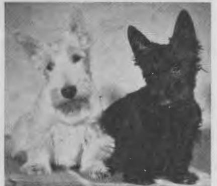
TAFFY and DAFFY Registered Garthright's Golden Harvest and Garthright's Jango Owned by Garthright Kennels, Oregon, Wisc.