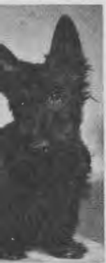
AFFY Golden Harvest Jango t Kennels, c. 's Heather Big e silver brindle aten, the othe