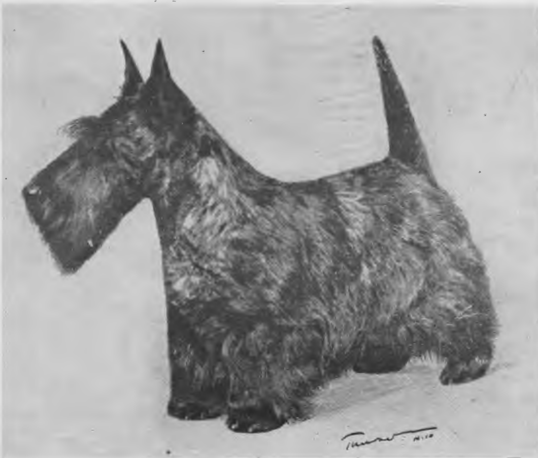
SCOTTISH TERRIER CHAMPION REIMILL RADIATOR

Owned and imported by Carnation Farms Kennel, Carnation, Washington