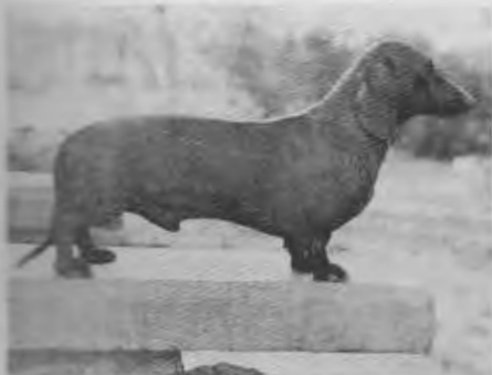
ACHAT VON WERDERHAVELSTRAND This champion dachshund captured the highest honors at the show of the Erie County Field Dog Club