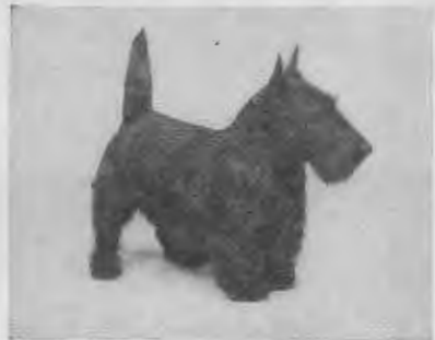
Flornell Silver Tip