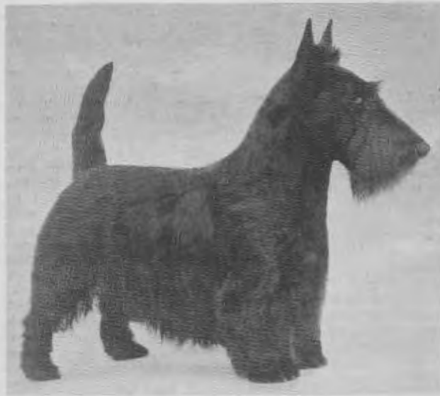
CH. GLENAFTON TAMARA