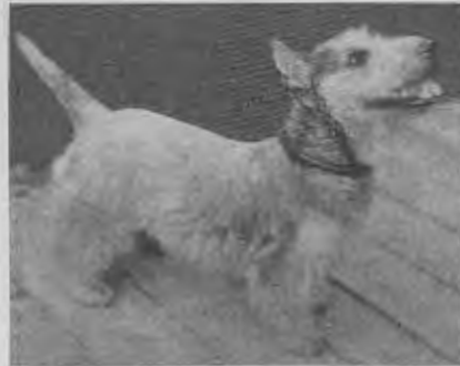
WHEATEN SCOTTIE PUP

ABBREVIATIONS: Ch.—American Kennel Club Champion; Br. Ch.—English Kennel Club Champion; WD—Winners Dog;