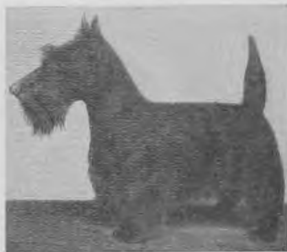
Ch. Craebert Commander AT STUD—Fee $35.00

A Sire reproducing the soundness and correctness of type which carried him through a show campaign to Championship Undefeated Winners Dog.