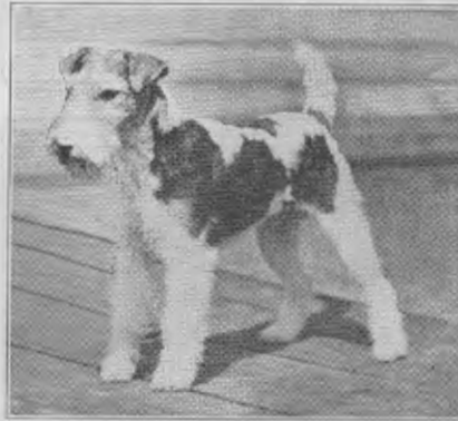
GENERAL CRACK OF CASWELL