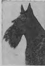
Ch. Edgerstoune Spitfire