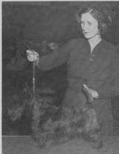
Best in Show—Worcester, Mass. HEATHER COMMODORE OF EDGERSTOUNE