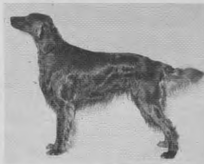
Best in Show - - - Durham, N. C. CH. REDBART KENDRICK (Awaiting AKC confirmation) Owned by