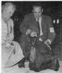
CH. REVVAN CLARION

In America the Rosehall Edward line has been around a long time without too spectacular a performance until the Bardene champions Boy Blue and Bingo were imported in the early 60's and soon caused a veritable population explosion in American champions. Both dogs were line bred and were eminently successful in the show ring and at stud. Together they have accounted for 65 champion descendants since their arrival. Last year Bingo topped off an illustrious show