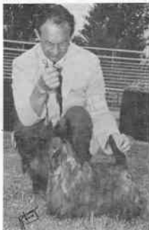
CH. CARNATION CASINO

For a number of years — around the 1950's — attention focused on a group of dogs we dubbed the "International Set." They were all well-publicized English imports of the Fashion Hint — Realisation line