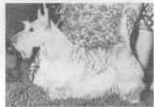
Leading Dam CH. YOUNG'S SAMANTHA