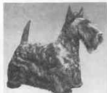
Leading Sire CH. BARDENE BOY BLUE

So far this year the star of Gaidoune is Ch. Gaidoune Good Will by Ch. Gaidoune Grin and Bear It, who by the way is now the sire of ten champions, out of Ch. Gaidoune Gisele who has produced eight bear-