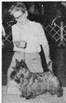
CH. SANDISSY'S PETTINA DEE LYN