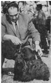
CH. REVVAN CHRISTMAS CAROL