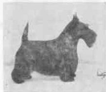
Leading Dam CH. CARMICHAEL'S FANFARE

The Club has two National Specialties planned to come this year. The one will be at Denver in April and will undoubtedly be