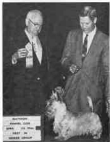
CH. SHARONLANE GOLD MEDALION

Those sires which produced three each of the current Champions include Ch. Bardene Bobby Dazzler, Ch. Barberry Knowe Blizzard, Ch. Blamart Bold Ruler and Ch. Anstamm Dark Venture.