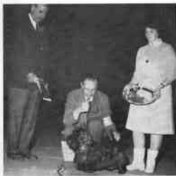
"Casino" Winning Group at Palouse Hills (From the classes)

Bingo, top winning Terrier for 1966, was also among the Top Ten in 1965. He came to this country late in the summer of 1964, and he is already the sire of eight American Champions. Among Bingo's many Best in Show wins, he has for three successive years placed Best in Show at three of America's largest and most important events — Beverly Hills in 1965, Santa Barbara in 1966 and Westminster in 1967.