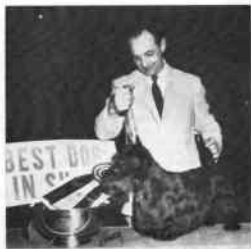
"Bingo" Winning Best in Show Westminster, 1967