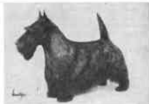
CH. DEEPAHVEN RED SEAL

move up into the 20 or more class in the near future. The next two in line with 16 each have finished their careers and thus for the present the top class remains at ten. All this is not meant to imply that only those on the list will produce quality progeny but past experience indicates that producing blood-