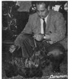
CH. CHARVES RACHAEL RAE