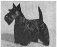
CH. BLANART BEWITCHING

Here's news of a new Champion, Gaidoune Dockie Plaid, the first Champion for her owners, and a