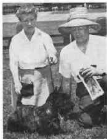
CH. TODHILL'S THUNDER BEAR

When we got the picture of Ch. Reab Hill Merry Quite Contrary this month, we weren't too sure as