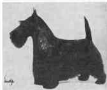
CH. WALSING WINNING TRICK OF EDGERSTOUNE

THAT the popularity of the Scottish Terrier has grown steadily in the last few years is demonstrated again at the close of 1966 by an announced 20% increase in total registrations. The average per month has risen to just under 550 dogs and bitches. At the same time, the Stud Books which now list only those used for breeding are averaging about 100 per month, the difference in the two figures indicating the large number sold only as pets or companions. A closer look at the Stud Book listings reveals that about 50 to 60% are not a part of the world of the show dog. Their registered names have no kennel prefix and the names of their sires and dams convey no hint of producing lines. The picture, of course, varies from month to month but in a year remains fairly constant showing that the bulk of the breedings are being made by or for the pet trade. Increased total registrations do mean breed popularity with greater demand for puppies but unfortunately do not indicate greater quality in