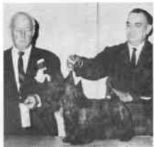
CH. HIL-RAY'S SIGNAL ENCORE