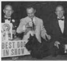
CH. BARDENE BINGO