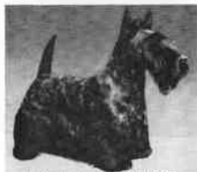
ENGLISH & AMERICAN CH. BARDENE BOY BLUE