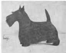
CH. GAIDOUNE GREAT BEAR

Ch. Heather Gold Finder who is on the top list with 20 champions and the Diehards and Cabrachs which resulted in the long line of Blanart champions. Ch. Blanart Bolero is the most recently successful sire in the Barty line but perhaps his chief claim to fame is through his daughter, Ch. Blanart Bewitching, who combined an excellent show career with a high place among top producing bitches with seven champions to date. This year Bolero has returned to the support of the Barty line through a grandson, Ch. Blanart Bold Ruler.