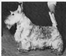
A new Champion CH. YOUNG'S M. B. F.

As for non-championship shows Ch. Ellburn Elegance was reserve best in show at Paisley, C. S. open show which had 414 exhibits. She was also best in show at Edinburgh's East of Scotland open show where there were 343 exhibits.