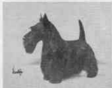
CH. HIGHLANDER BARRISTER

We have reports this month on a number of shows held on the West Coast—Washington, Oregon and California. The Umpqua K. C. event