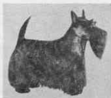
INT. CH. GLAD-MAC'S ROLLING STONE

In deciding to mate Bonnie we have become potential breeders. Our motives are good for we want a better dog than Bonnie. Now consciously or unconsciously we must