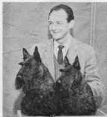
1958 Westminster Winners

A serious breeder must be familiar with the almost insurmountable task of trying to trick the genes and chromosomes into the right combination to produce the quality desired. This is the point at which many potential breeders become dis-