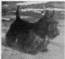
SIEGEL'S BON HOBART