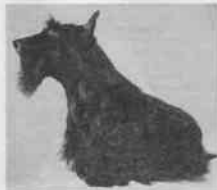
In a Relaxed pose at age 12