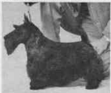
CH. CARNATION COURTESY Owned and bred by: Carnation Farm Kennels, Carnation, Wash.

In our own territory, the Scottish Terrier Club of Northern Ohio reports an active year with plans ga-