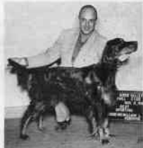
Ch. Scotch Burr of Gunbar C.D. 1st in Group, Rock River K.C. Nov. 58

Your chance to get in at the top with proven winning Gordon Setters.