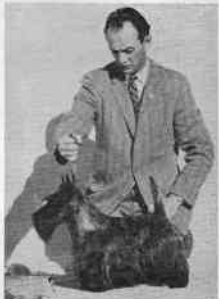
CH. CARNATION DARK WARRIOR