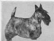
CH. CRESCENT HILL LEONID (Awaiting AKC Confirmation)

of the contemplated puppy, the more apt this puppy is to resemble the progenitor ancestor. It must still be remembered that if this ancestor had faults (and no dog is perfect) the possibility of these faults being inherited is also intensified.