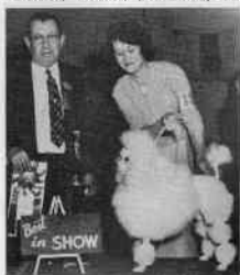
Best in Show—Macomb County Miniature Poodle SANGAREE'S THE DESIRE