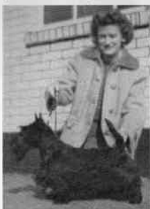
The late CH. WALSCOT'S MAC DUFF

The leading sire is Ch. Edgerstone Troubadour with six of the current Champions to his credit. Close on his heels is Ch. Westpark Derriford Baffie, sire of five of these current Champions. In third spot we find Ch. Blanart Bolero with four Champions, followed by Ch. Friendship Farm Diplomat and Ch. Deephaven Red Seal, each the sire of three of the current Champions. Quite a few dogs sired two Champions each and they include: Ch.