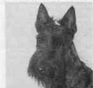
Wychworth Windfall (Eng.)