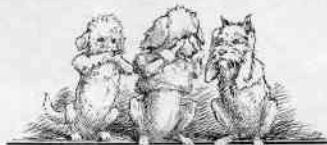
"Speak no evil, see no evil, hear no evil" and Dog Shows will be more fun!