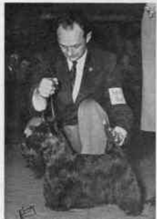
CH. CARNATION DARK STAR Owned and bred by Carnation Farm Kennels, Carnation, Wash.