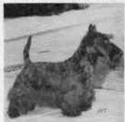
Ch. Marlora Dark Seal