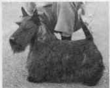
CH. CARANATION DARK SENTRY Owned and bred by Caranation Farm Kennels, Caranation, Wash.