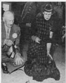
CH. GAYCLAN GLAMOUR GIRL