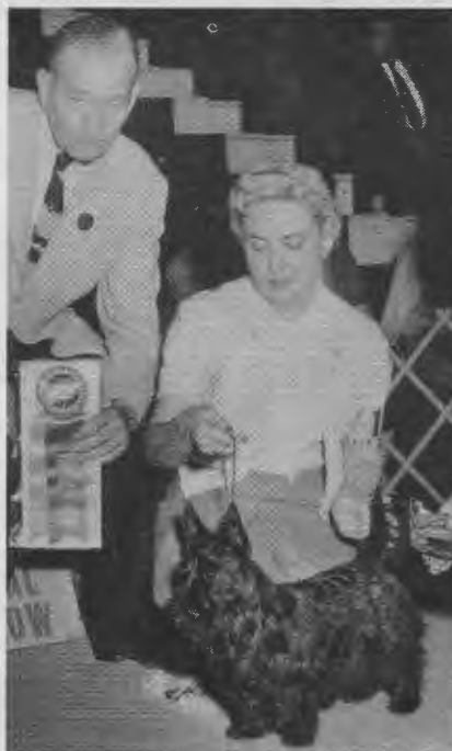
CH. MEL-JEAN BONNIE