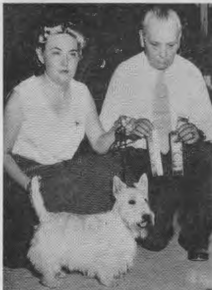
CH. CLINCH MT. COPPER KING