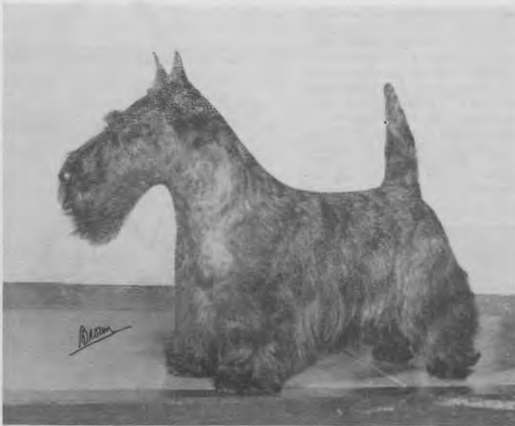
CH. REBEL RAIDER