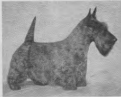
ENG. CH. WESTPARK RIO GRANDE