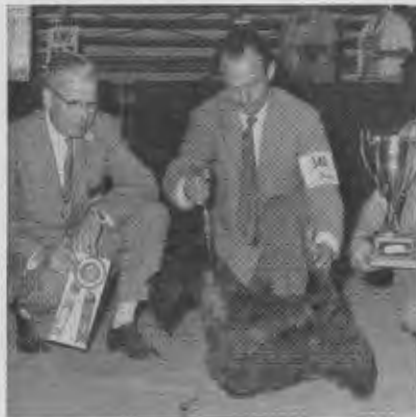
English, American, Canadian

Legs and Feet. —(10 Points): Both fore and hind legs should be short and very heavy in bone in proportion to the size of the dog. Fore legs straight or slightly bent with elbows close to the body. Scottish Terriers should not be out at the elbows. Stifles should be well bent and legs straight from hock to heel. Thighs very muscular. Feet round and thick with strong nails, fore feet larger than the hind feet.