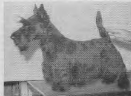
RANNOCH-DUNE RARE BIT