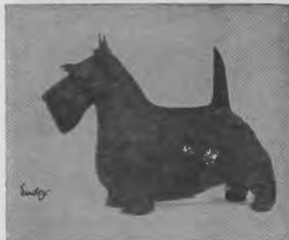
CH. BLANART BARRISTER

Muzzle —(5 Points): In proportion to the length of skull, with not too much taper toward the nose. Nose should be black and of good size. The jaws should be level and square. The nose projects somewhat over the mouth, giving the impression that the upper jaw is longer than the lower. The teeth should be evenly