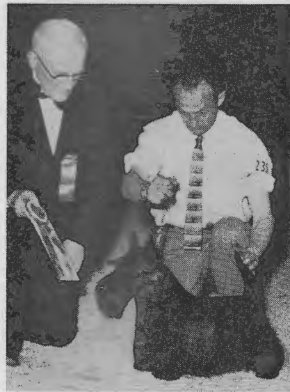
CARNATION DARK SENTRY