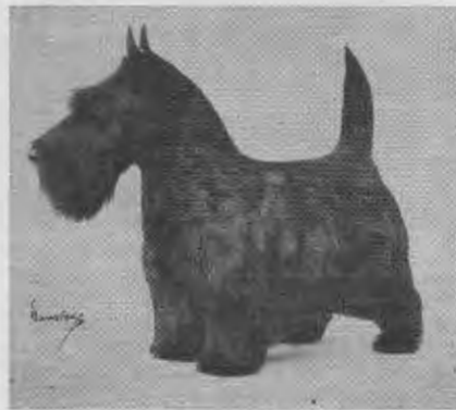
CH. ORTLEY AMBASSADOR OF EDGERSTOUNE

More important than Asset, however, was the Ambition line thru Int. Ch. Ortleby Ambassador of Edgerstoune. Ambassador sired many producing sons but unfortunately for the line's continuation the majority of these have, in turn, produced more