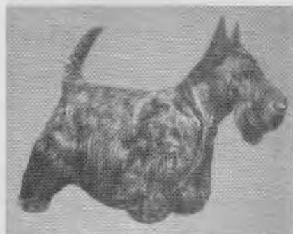
CH. DUKE OF MELBOURNE