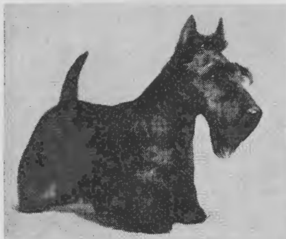
CH. SEAGRAVES ANCHOR MAN

His 1956 record is equally impressive. He won twenty-two Best of Breeds, four group firsts, six seconds and a number of other group placings. In addition to this he was Best in Show All-Breeds at the Roanoke