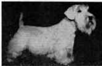
CH. MAR-LYN GLORY Owned by Mar-Lyn Kennel, Knoxville, Tenn.