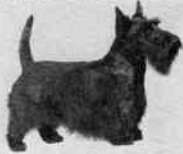
Grand young brindle son of Edgemoor's Latest Deal

(See the Ch. Superdemon Squire or Ch. Heather Laidlaw, both of Superdemon and Mine Brook, same sire to Ch. Striving's Progress or Mine Brook Fair Maid.)