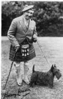
A PAIR FAMOUS IN THE THIRTIES Sir Harry Leander and Ch. Heather