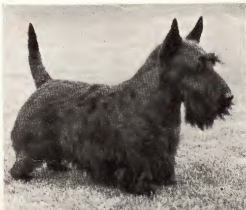
CH. CABRACH MAC GREGOR II