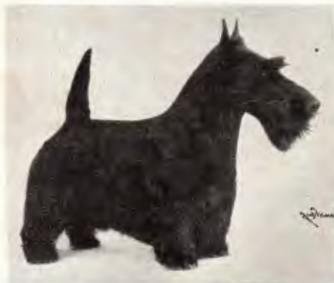
CH. WALRING WHIRLWIND