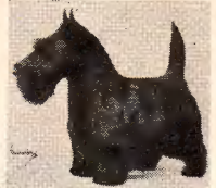
Ch. Ortleay Ambassador of Edgerstoune