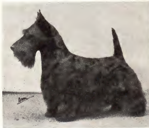
CH. SHIELING'S DESIGNER