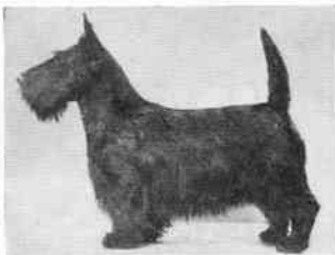
CH. ROSEHALL ROAMER