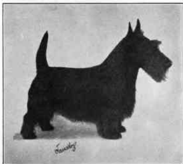
ENG. CH. DANDY OF DOCKEN O'MARLE