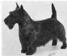
CH. HEATHER SUMMERSE OF HITOPA

Marla Farn Kennel, West Long Branch, N. J.