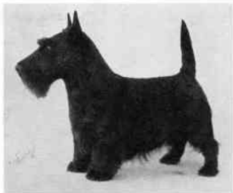
CHAMPION HEATHER COMMANDER OF DIEHARD