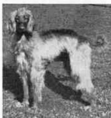
A TYPICAL AFGHAN HOUND