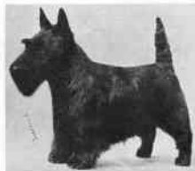
CH. BALGAY BARONESS