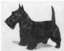
CH. SCOTSWARD ROMANCE