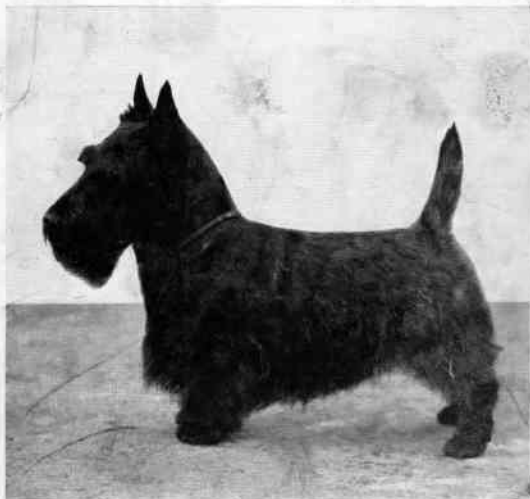
THE SCOTTISH TERRIER CHAMPION HEATHER PREMIER