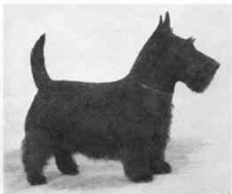
INT. CH. LONKLEY LARKSPUR OF HITOPA