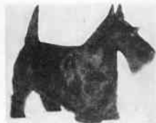
CH. GAISGILL DAPHNE