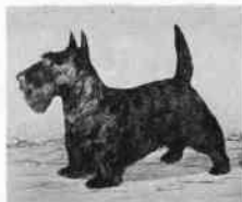
CH. SPORRAN ROGER

I received stud cards, and in most cases explanatory letters, from some fifty kennels. They ranged from far up in New England to up and down in California; from out in Oregon to down in Louisiana. The composite is interesting. If the replies I have received