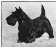
CH. FOBBLE OF HARKEN.