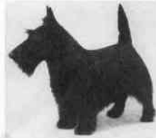
CH. BLACK ROSE OF DOCKEN