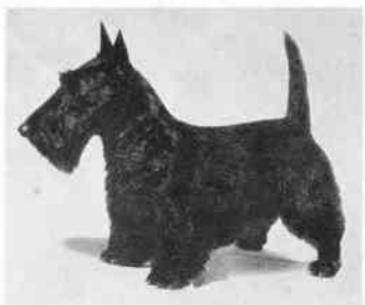
CH. SCOTSWALD ROMANCE

It seems appropriate to set up an HONOR ROLL OF AMERICAN BREEDERS, inscribing therein the names of those present-day breeders who have bred more than one Scottish Terrier Champion.