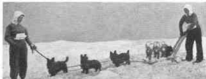
SCOTTIES USED AS SLED DOGS AND TAKING TO THEIR JOB LIKE ALASKAN HUSKIES.