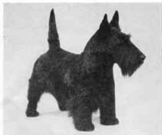
CH. MONAGH LEA DANDY

THE article which appeared in the April, 1934, issue of Dog News entitled "The 1933 Parade of Champions" threatens to become a serial with annual installments. Perhaps this year's article should itself appear in serial form as we find it difficult to reconcile our desire to set forth a reference library of the most interesting and important facts with our desire to restrict the article to a reasonable length.