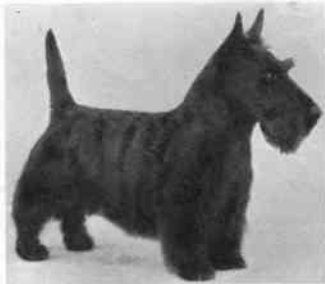
CHAMPION HITOFA CHIEF Owned by Hill Top Farm Kennels, Greenwich, Conn.