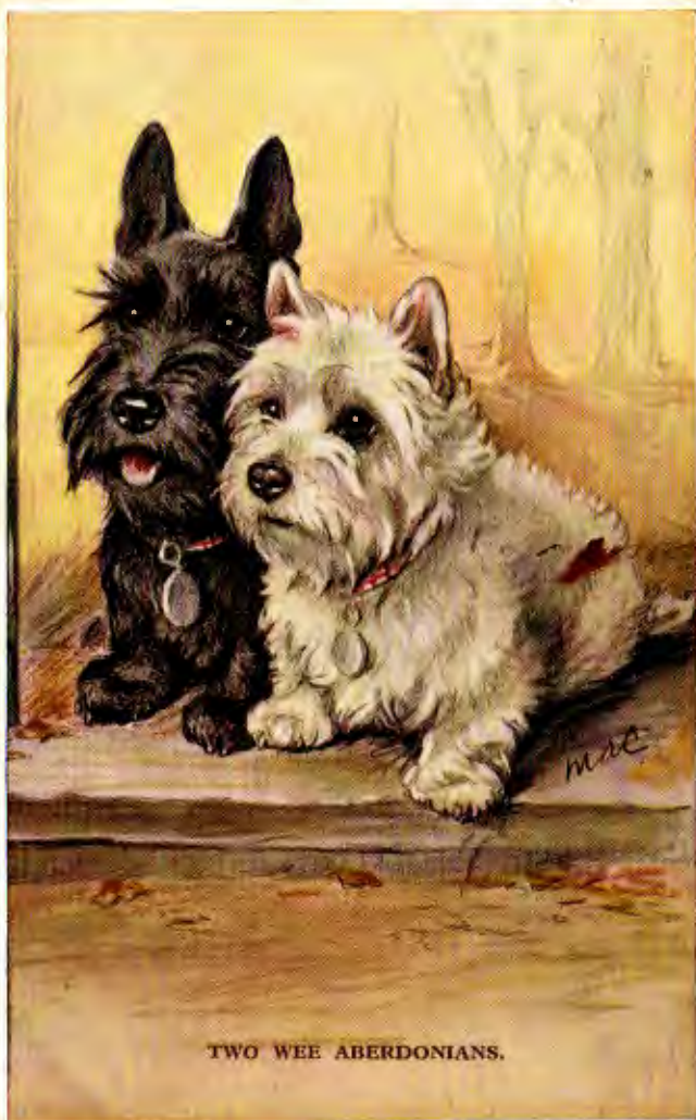
TWO WEE ABERDONIANS.