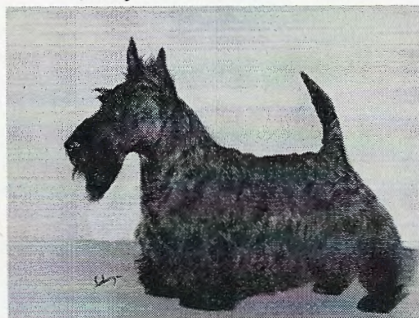
CH. WYCHWORTH WINDFALL (Eng.) (Ch. Special Edition ex Wychworth Wishbone) "WINDFALL" has sired 2 CHAMPIONS to date in 1963 and is sire of WB-BW, 1960 S.T.C.C. Specialty; BB & WB, 1963 S.T.C.C. Specialty.

ALSO YOUNG, PROVEN SONS OF CALIFORNIA'S LEADING SIRE