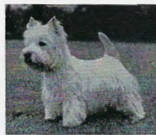
One of our homebred champions