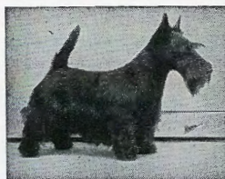
One of our homebred champions

STUD DOGS SHOW DOGS and COMPANIONS always for sale