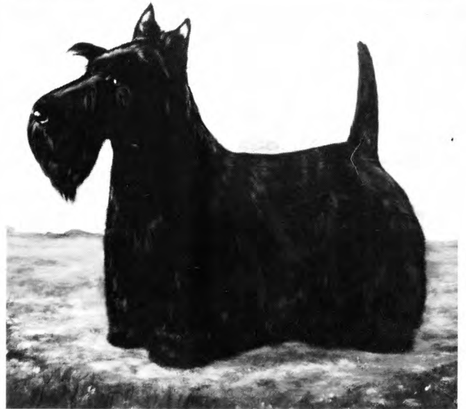
CH. Heather Isles Black Ice "IAN"