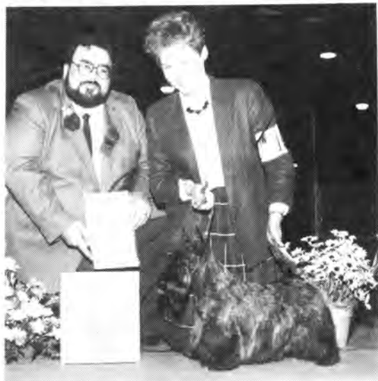
CH Baggpiper's Top Gun X CH Baggpiper's Silver Shadow