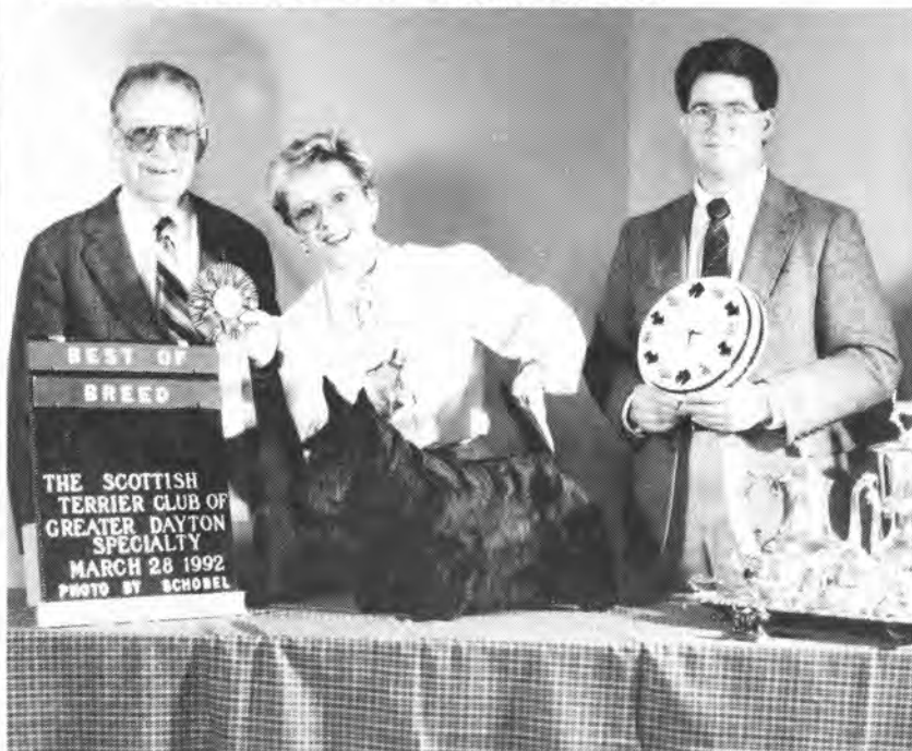
(Ch. Anstamm Flash Point X Anstamm Short Circuit)

It's Multiple Group & Specialty Winner Ch. Anstamm Low Commotion. . .