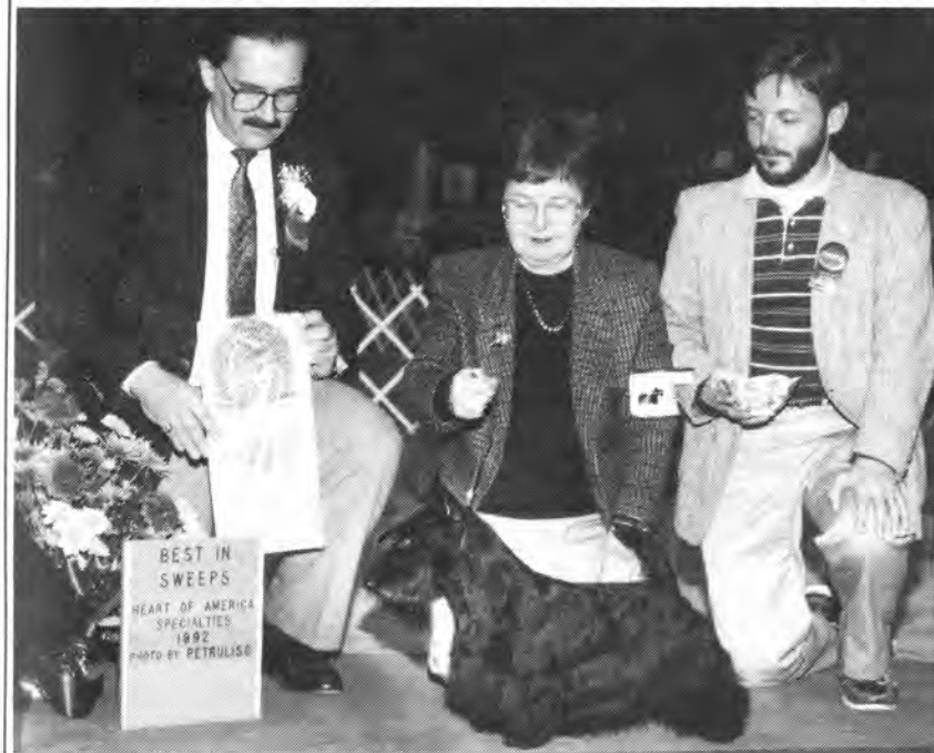
(Ch. Anstamm Flash Point X Ch. Anstamm Heat Wave)