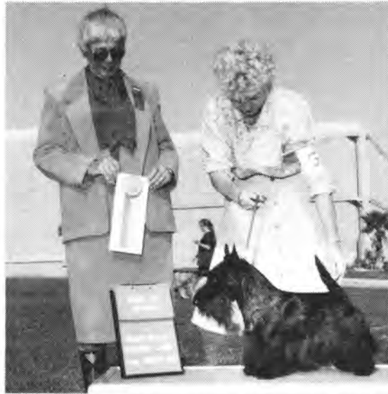
Eng/Am Ch Kennelgarth Romeo X Ch Bairnsdale's Golden Girl