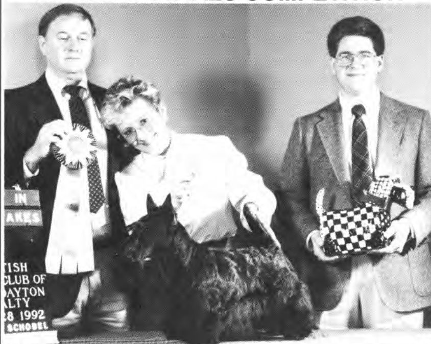
(Ch. Anstamm Loud And Clear X Ch. Anstamm Flash Fire's Cinder)