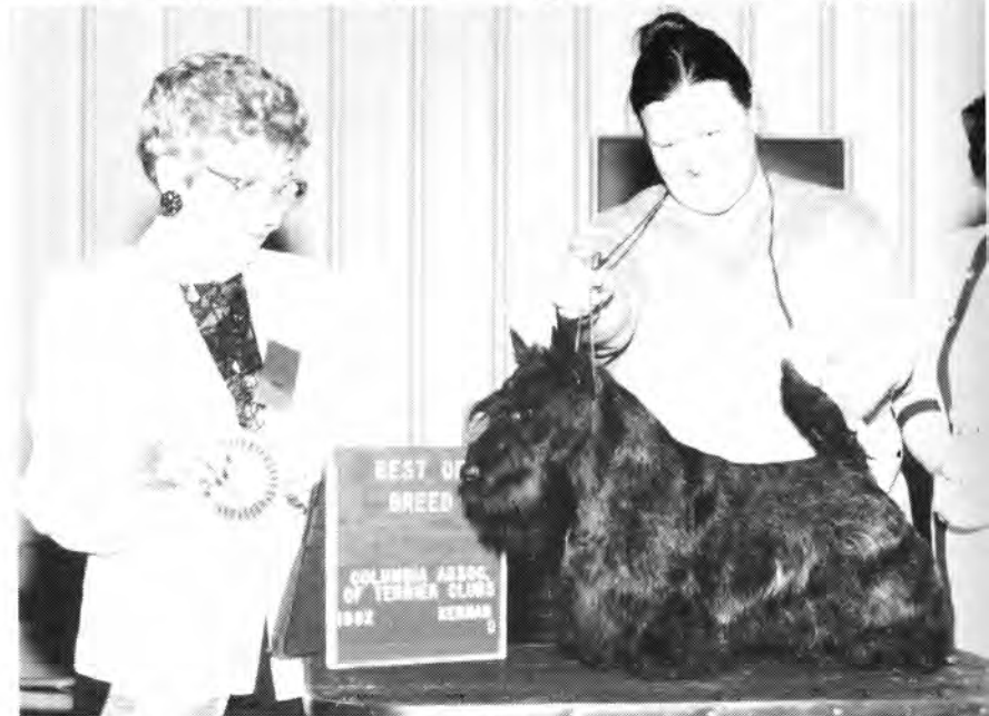
Ch. Sparwyn Chip Off the Old Block X Am. Can. Ch. Hughcrest Strut N' Spar