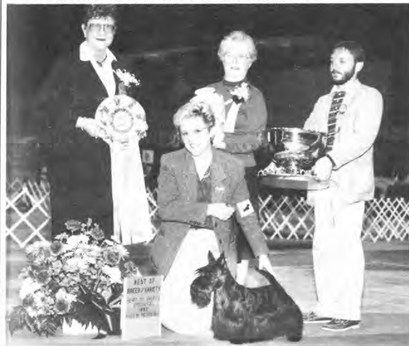
(Ch. Anstamm Flash Point X Anstamm Short Circuit)

It's Multiple Group & Specialty Winner Ch. Anstamm Low Commotion. . .