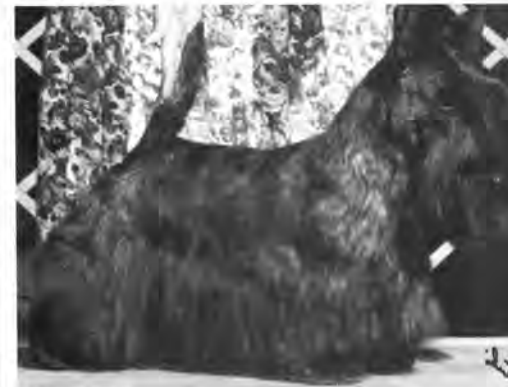
Am., Cdn., Ch. Tardun Talisman