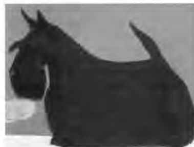
Ch. Deblin's Back Talk