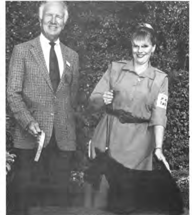
Sire: Ch. Stonecroft's The Game's A Foot Dam: Ch. Stonecroft's Victory Design

We extend a Special Thank You to the Judges mentioned above, making this a memorable championship