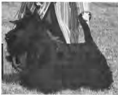
Ch. Sun-Ray Summer Sun

The ideal choice for the breeder with a slightly bigger, longer girl. "Barney" is an excellent choice to bring down size without losing substance. "Barney" is the sire of 11 champions, including Group-winner, Ch. Charthill Worthy of Colwick, and Ch. Anstamm Sneak Preview, WB at the 1990 STC Chicago Specialty. VWD Clear.