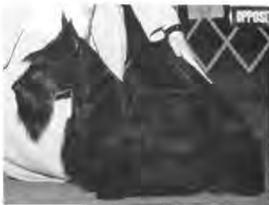
Ch. Anstamm Flash Point