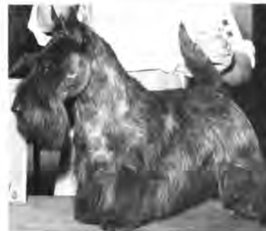
Ch. NorStar Blackjax Crakrjax

Miriam Stamm, Cindy Cooke 2097 South 4th Street Kalamazoo, MI 49009 (616) 375-0427 Linda Nolan 100 W. US Hwy 6 Valparaiso, IN 46383 (219) 462-7199