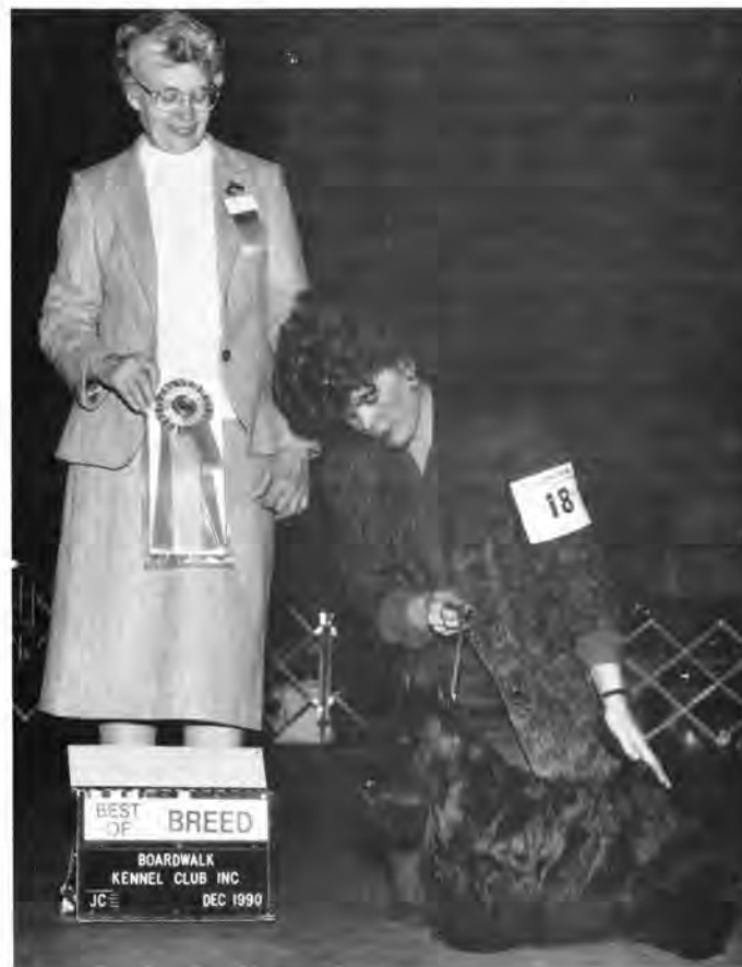
(Ch. Deblins Back Talk x Ch. Deblins Double Talk)