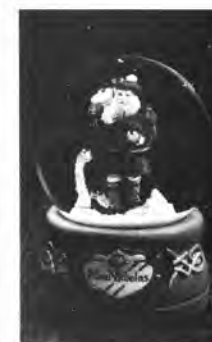
MUSICAL SNOW SCENE