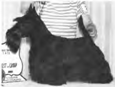
Am./Can. Ch. Terriwalls Captivator

"Logan" finished his Can. Championship with a Group I, II & III. He is siring gorgeous puppies - with excellent shoulders, short backs and super showmanship. He is one of "Main Events" best. VWD 12090.