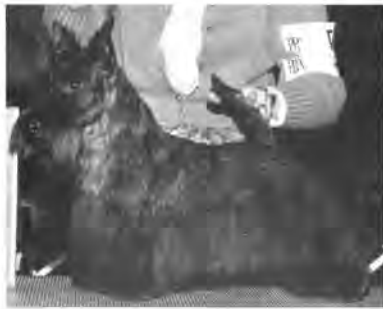
Ch. McEntire's You're The Reason

'Louis' has a straight back and full hard coat. He has an elegant face and head with a small ear set, moves well and shows lots of spirit in the ring. He has the charm and presents of a true Scottish Terrier. VWD tested at 108%