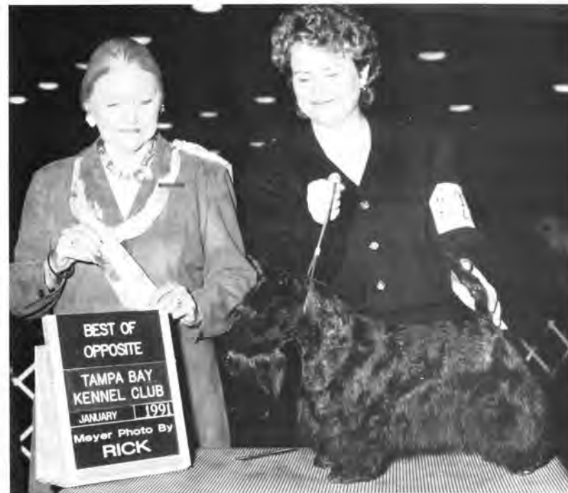
(Ch. Charthill Worthy Of Colwick x Heather's Maggie McGregor)