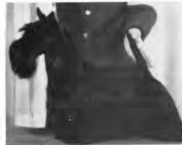
Am. & Cdn. Ch. Tiddlymount Imprint