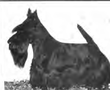
Ch. Anstamm Summer Lightning