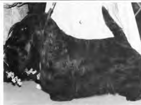
Ch. Kellscots Bedrock