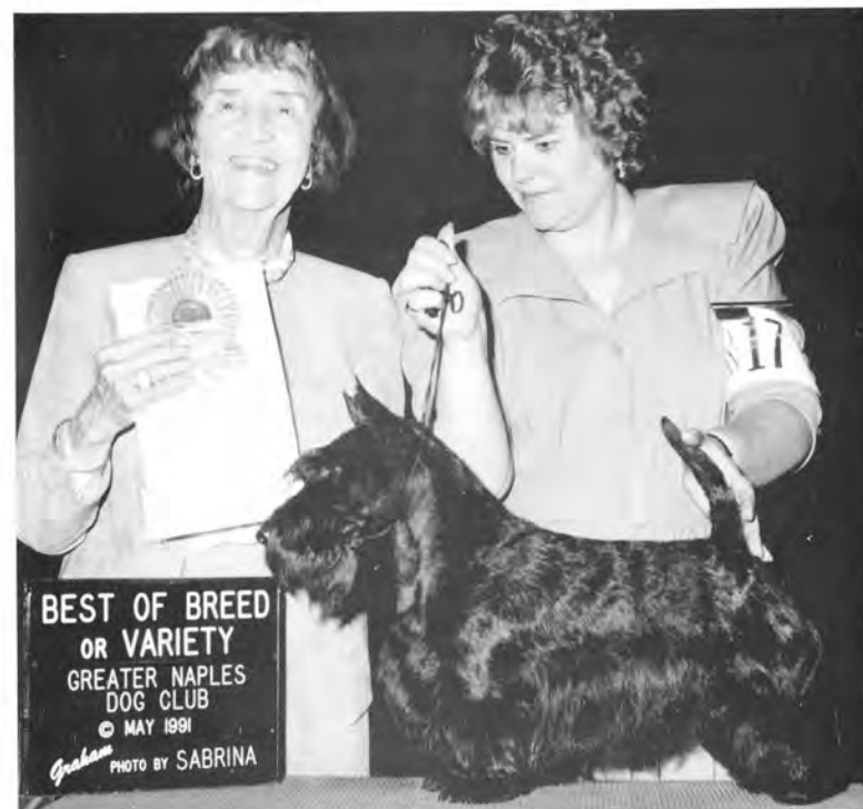
Ch. Charthill Worthy of Colwick X Heather's Maggie McGregor

Owner-handled, Fozzie completed his Championship in Grand Style , finishing with all majors (4-4-3-3-3) from the Bred-by Class.