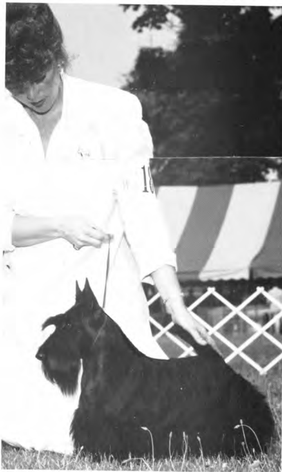
CH. DEBLIN'S BACK TALK x CH. DEBLIN'S DOUBLE TALK "PINKIE"