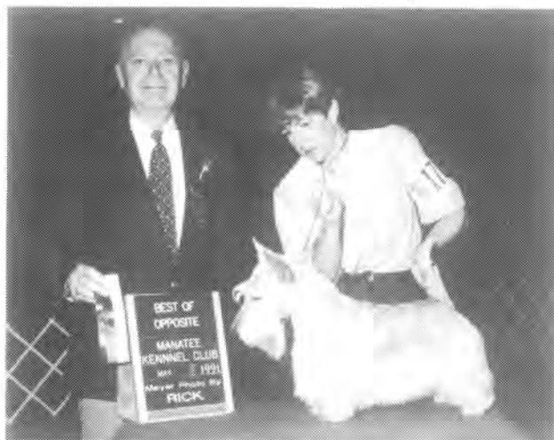
Boldmere Surf's Up

(Ch. McVan's Sandman X Ch. Boldmere Tarred 'n Feathered)