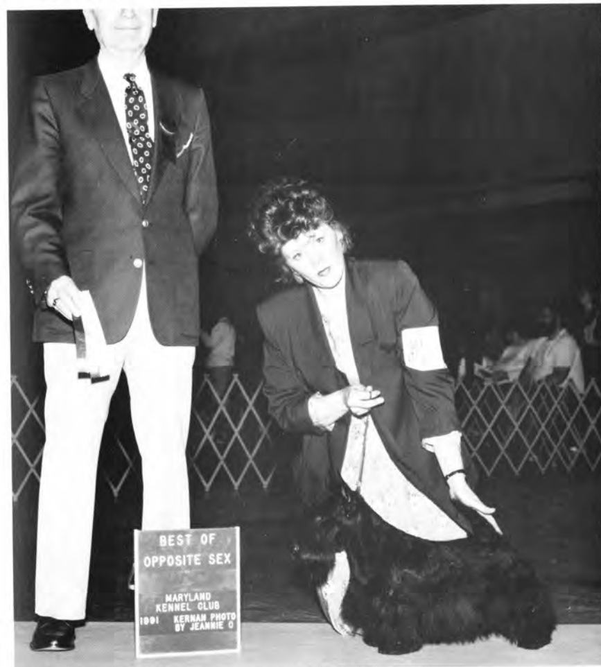
CH. DEBLIN'S BACK TALK x CH. DEBLIN'S DOUBLE TALK "JASON"