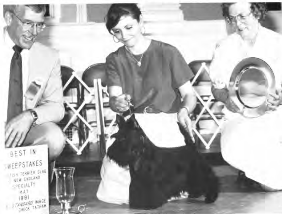
Ch. Charthill Worthy of Colwick