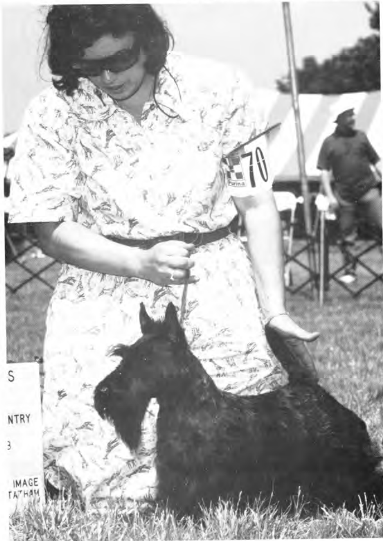
SIRE CH MC JONES HAIL SHERGAR DAM. MC JONES WITCHES HOLIDAY

Here Where The Olympic Meets The Sea, We At Mc D's Of Klallam, Welcome Home Our Own "Miss Fiona Mc D's of Klallam"