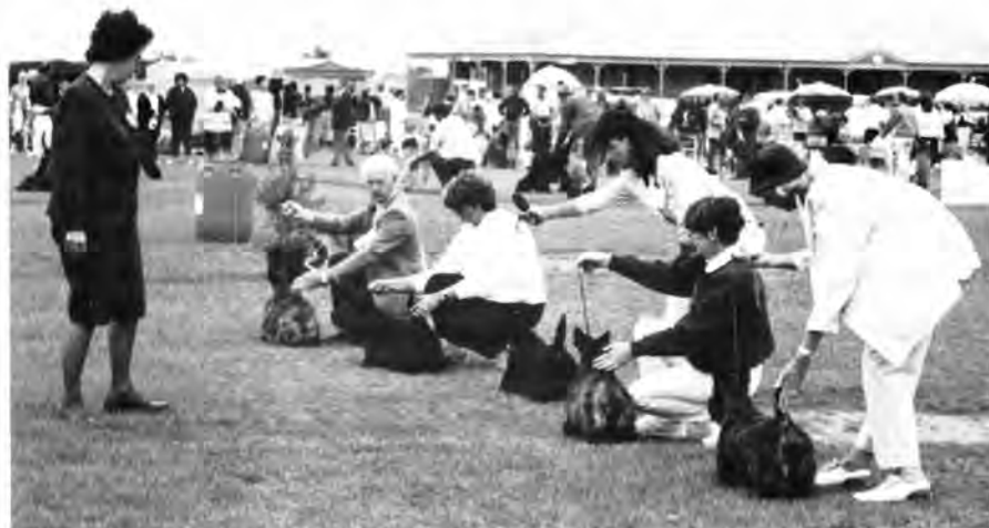
The author examining a class of bitches. The last in line was the eventual BB choice; the first in line the runner-up.

I loved all of the dog activities and admired Australia's beautiful scenery, but I will never forget the people nor the often repeated statement "not to worry". That may be their secret.