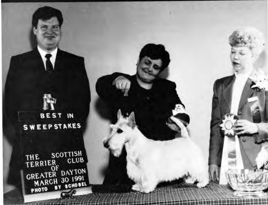
Ch. Sandgreg's Second Edition X AM. Can. Ch. Maggie McMuffin V