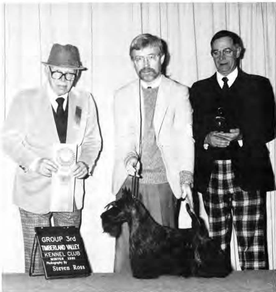
(AM. CH. WHISKYBAE YANKY STUNT MAN EX AM. CH. BARRAGLEN'S B SHARP)