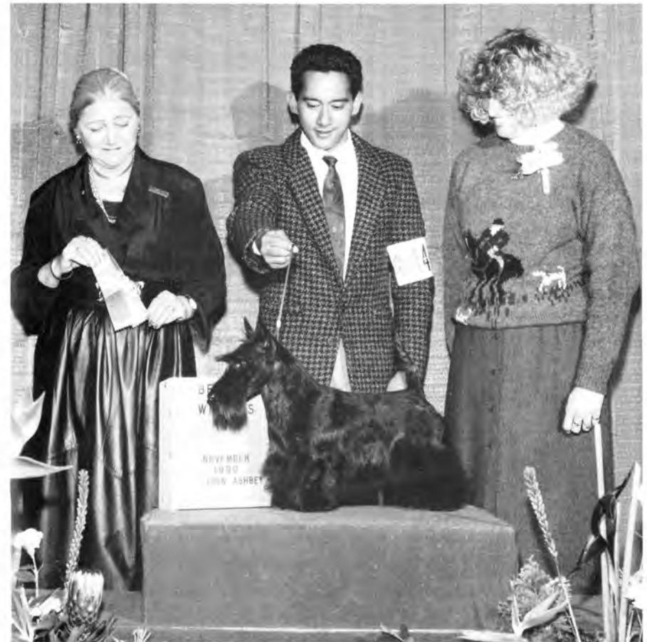
CH. KILLISPORT TOWN AND COUNTRY x CH AMBRETTE'S I'M A SENSATION