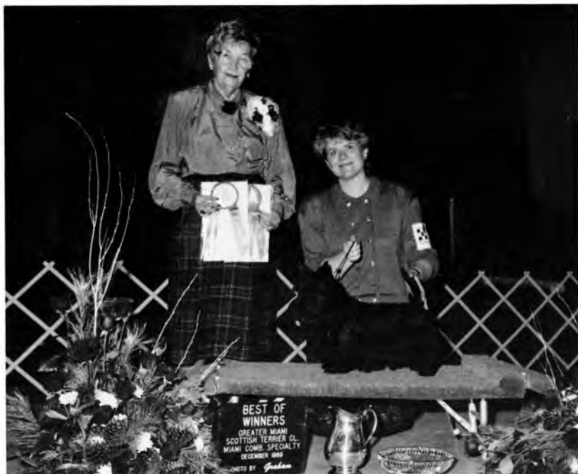
(Eng. Am. CH. Kennelgarth Romeo - CH. Ravenscraig Rhapsody)