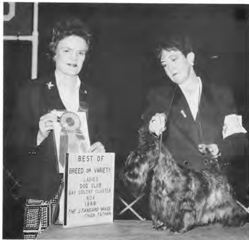
BLUEBERRY'S DRESSED TO KILL CH. Glenby's Royal Ruler x CH Blueberry's Centerfold