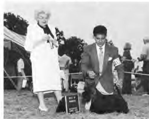
Ch. Anstamm All American x Mirriemoor Seaside Fantasy