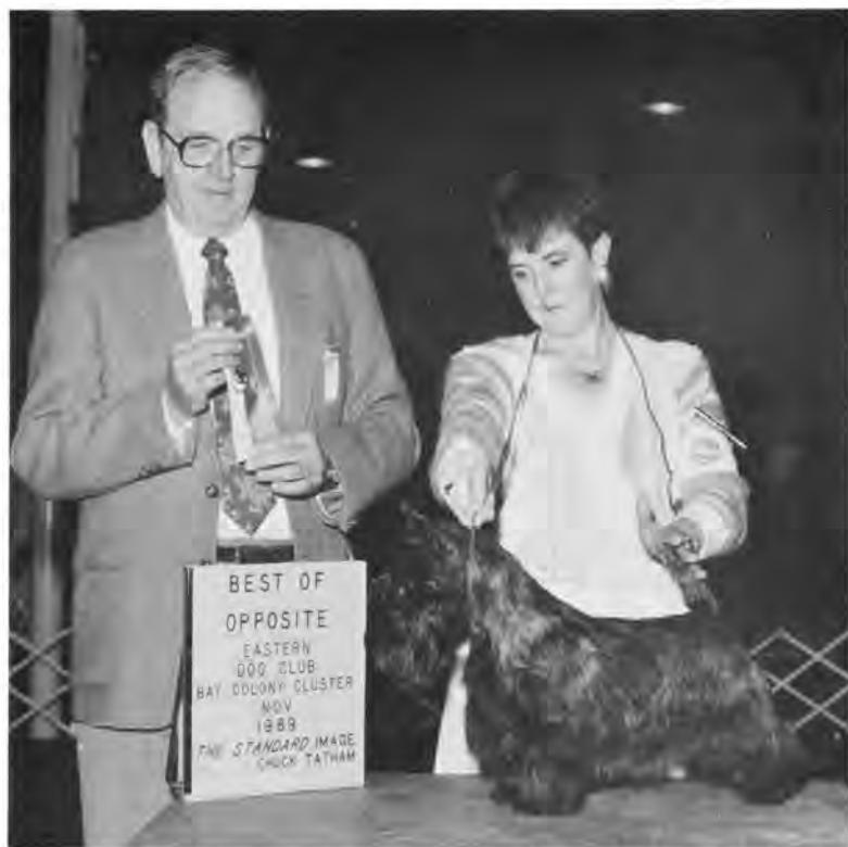
PATCAY'S IF LOOKS COULD KILL CH. Glenby's Royal Ruler x CH. Blueberry's Centerfold