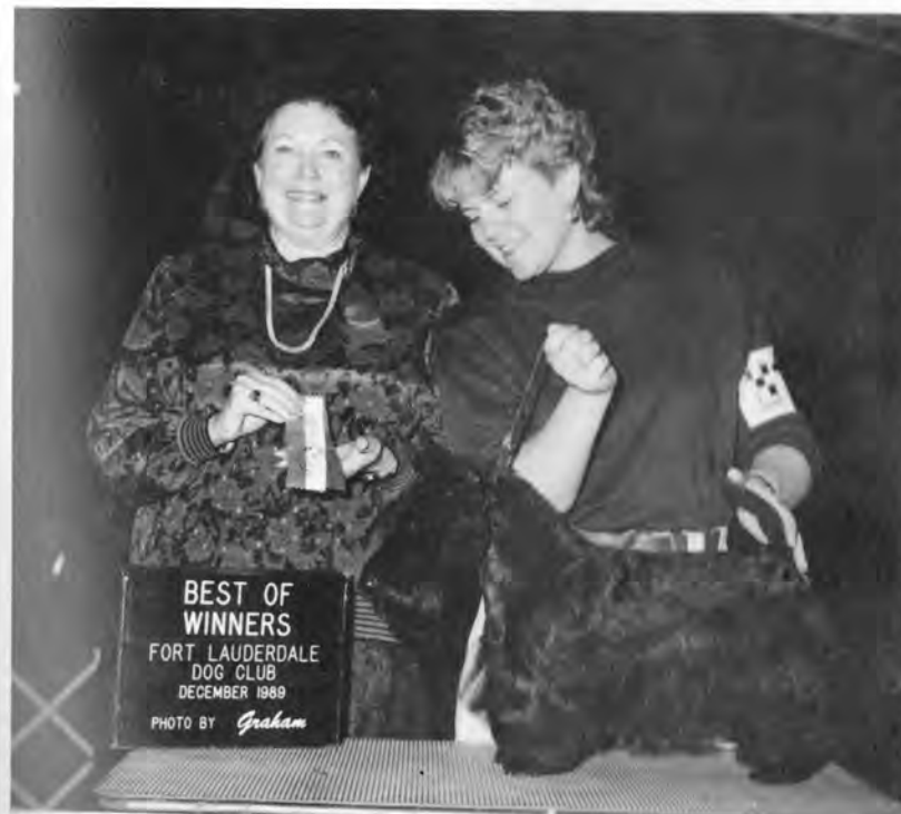
(Eng. Am. CH. Kennelgarth Romeo - CH. Ravenscraig Rhapsody)