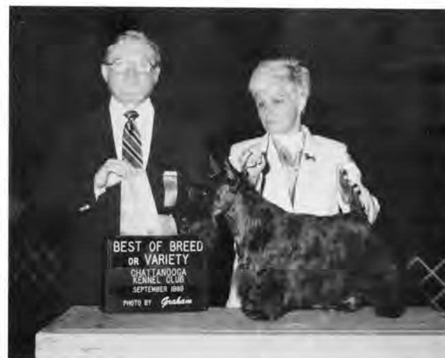
Ch. "Spike" has a Terrier Group II from the classes!

(Ch. Redoubt's Front Row Center x Vikland's Sweet Gem)