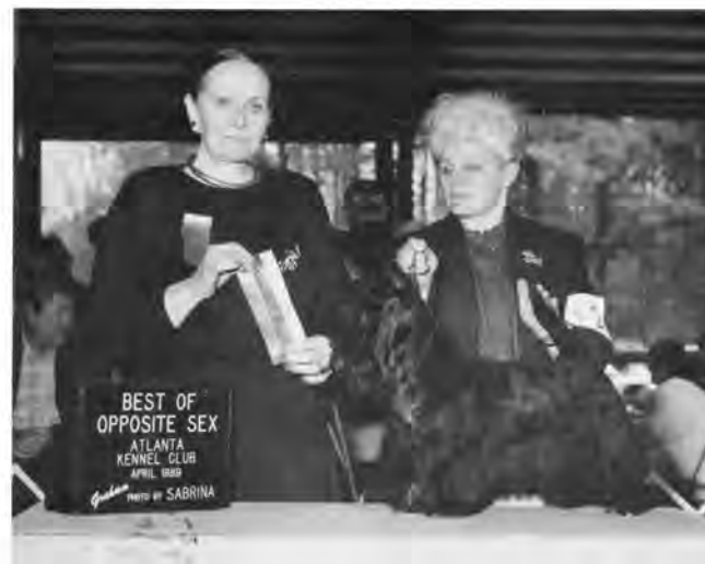
"Gus accepting a 5 point major!

(Ch. Vikland's Kings Delight x Ch. Vikland's Curtain Call)