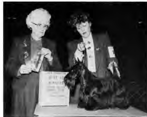
Ch. Deblin's Back Talk x Mirriemoor Seaside Fantasy