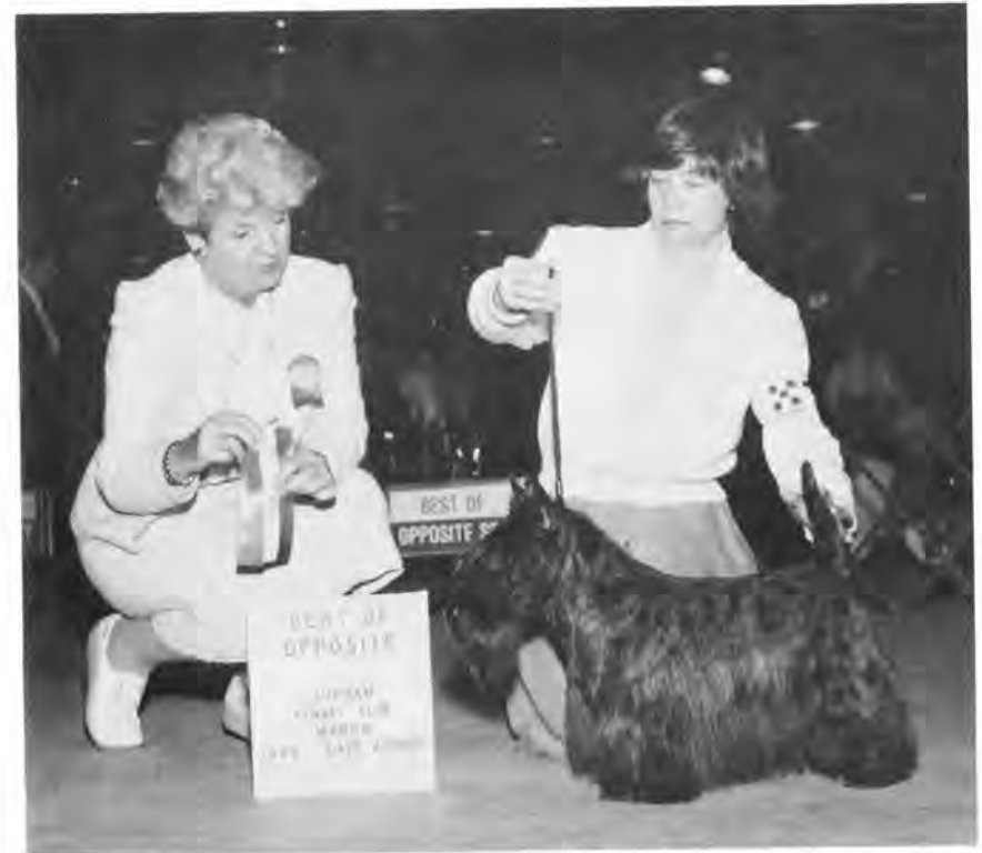
CH. AERIE HERITAGE OF VISION X AERIE TRADEWINDS

Linebred, going back to the GAIDOUNE BEARS