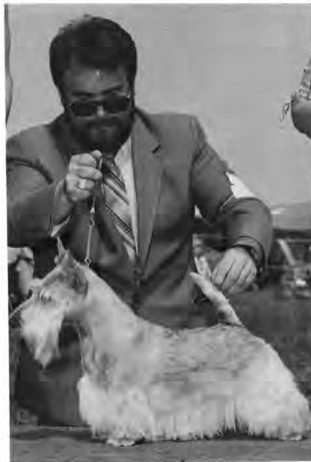
CH. SANDGREG'S SWEET LUV

THE CHAMPION LADY ALBERT MEMORIAL TROPHY WINNER 1988