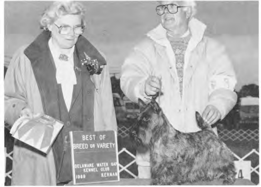
CH. Schaeffer's Redson x Brookhill Black Beauty

NEW! CH. Brookhill Hope And Glory "Bailey" A double "Playboy" granddaughter!