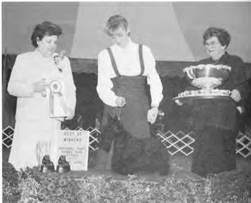
Ch. Sandgreg's Second Edition X Ch. MacPooch Ms. Michie

(New) Ch. Brookhill's Morning Edition (LOLA)