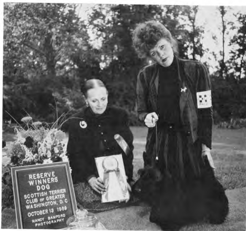
CH. Deblins Backtalk X CH. Hughcrest Daiquiri Doll