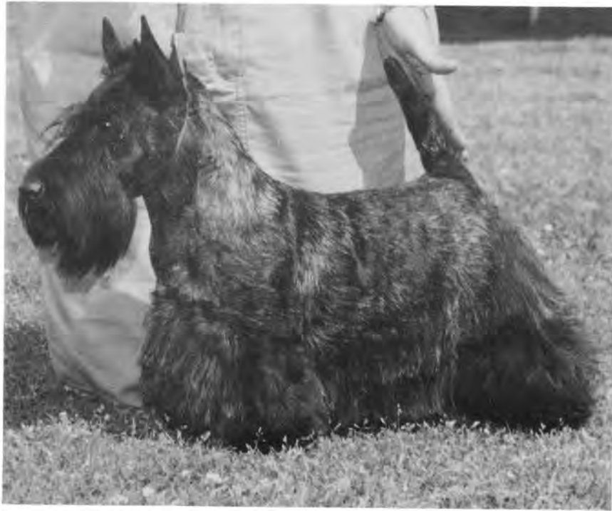
CH. SHATSCOT HEIR OF BROOKHILL (Ch. Schaeffer's Redson out of Can. Ch. Brookhill Fire Mist)

"Tippi" (Finished with five majors at the age of twelve months) was bred to (Winners Dog at Montgomery County, STCA National Specialty) Ch. Glenby Royal Ruler