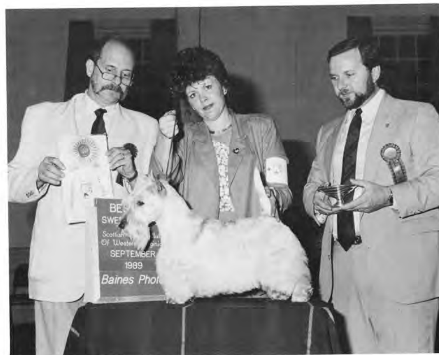
CH. Sandgreys Second Edition X CH. Dana's Gold Coin