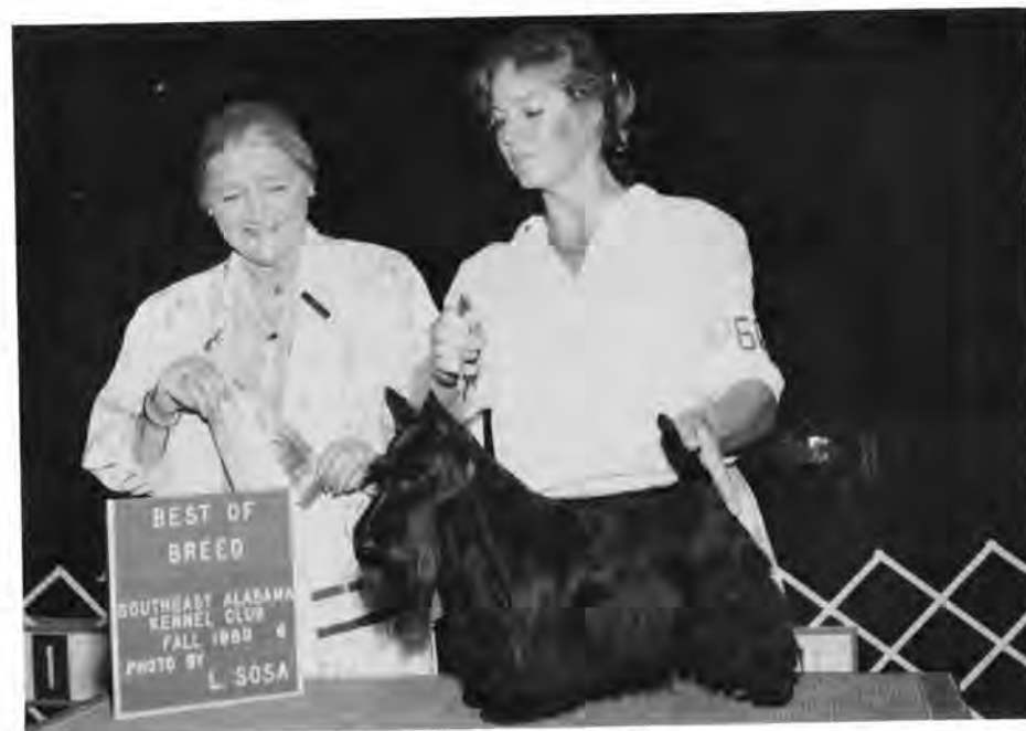
CH. STALWART GEORGIA ON MY MIND (Ch. Quercus Lasting Impression x Ch. Stalwart Amazin' Grace)

Has been on everybody's mind. New CH. STALWART GEORGIA ON MY MIND that is!