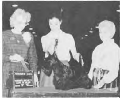
Ch. Quercus Court Jester (Ch. Micanda Royal Stuart x Quercus If You Please)