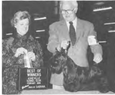
Ch. Quercus Music Box (Ch. Gaywyn Jazzman x Ch. Quercus In A Tiff)