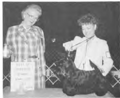
Ch. Quercus Gambler's Dream (Ch. Lucky Gamble of Quercus x Ch. Quercus Happy Guess)