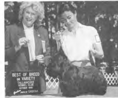
Italian, American Ch. Saorsa Dundee Dimension (Saorsa Aberdeen Triumph x Saorsa Ben Venue)