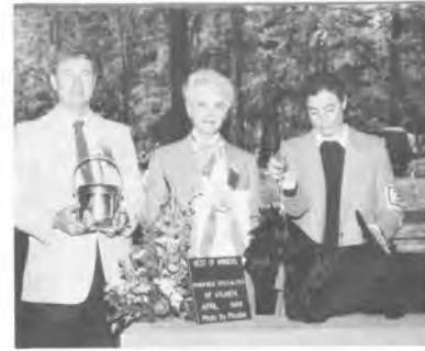
Ch. Quercus Trinity Winter's Tale (Ch. Enchanter of Eilburn x Ch. Saorsa Ben Rinnes)

1988 has been very generous to our Kennel !!! We have 9 new champions !!