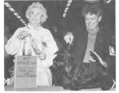
Ch. Quercus Unforgettable (Ch. Micanda Whizzbang x Ch. Quercus Black Gipsy)