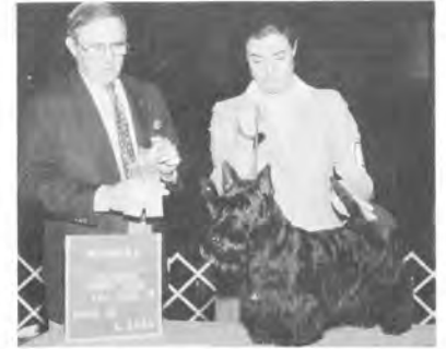
Ch. Quercus Infatuation (Ch. Quercus Wait And See x Quercus Up To Mischief)