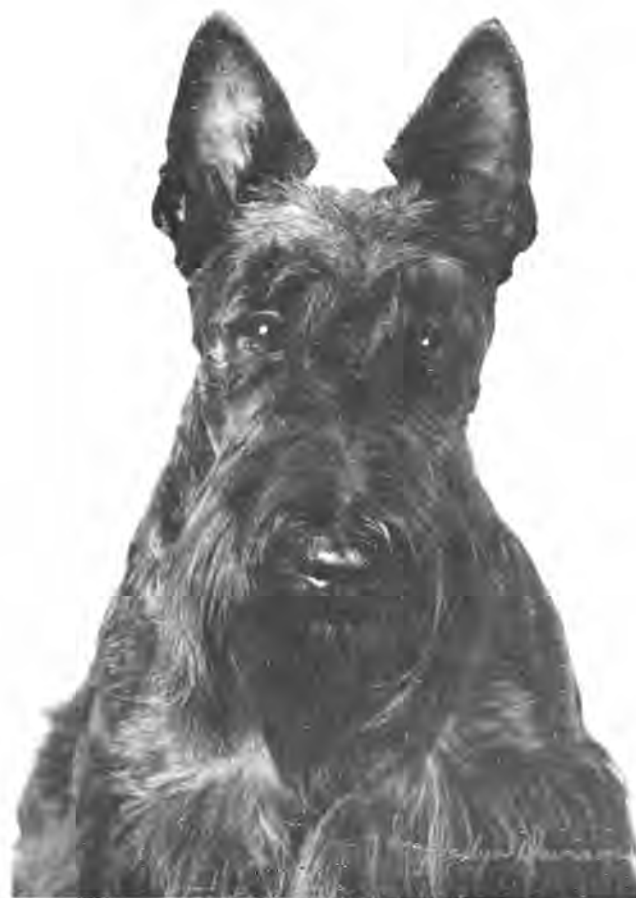
Ch. Whiskybae Yanky Stunt Man 1984 - 1988