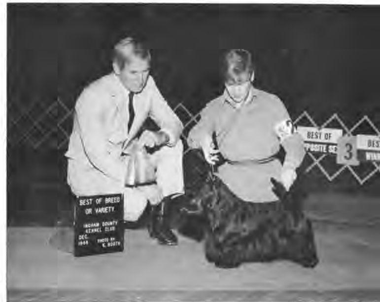
Ch. Sandgreg's Second Edition × Ch. Wychwyre Liberty