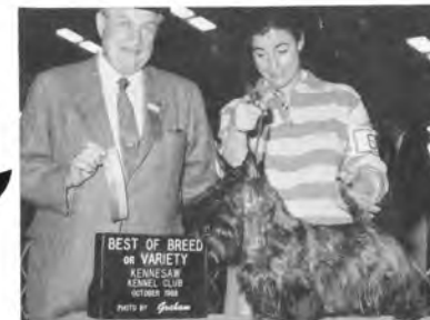
Ch. Quercus Black At Heart (Ch. Glenby Gallant Lad x Ch. Quercus Happy Guess)

Duchess Visconti di Modrone Route 1, Gay, Georgia 30218 404/538-6846