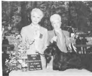
Ch. Micanda Whizzbang (Kennelgarth Canute x Micanda Dark Whizzper)

... And a very nice girl who may be "brindle" ... But is CH. QUERCUS BLACK AT HEART