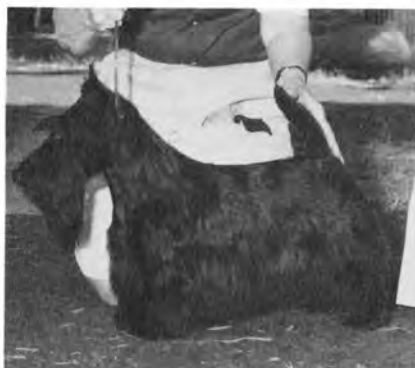
Ch. Anstamm Apache WD at the 1986 STC of Chicago Specialty BW to finish at the 1986 STC of California Specialty Multiple Group winner.