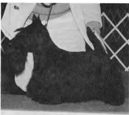
Ch. Anstamm Cheyenne Autumn Group winning Special — the week after she finished!