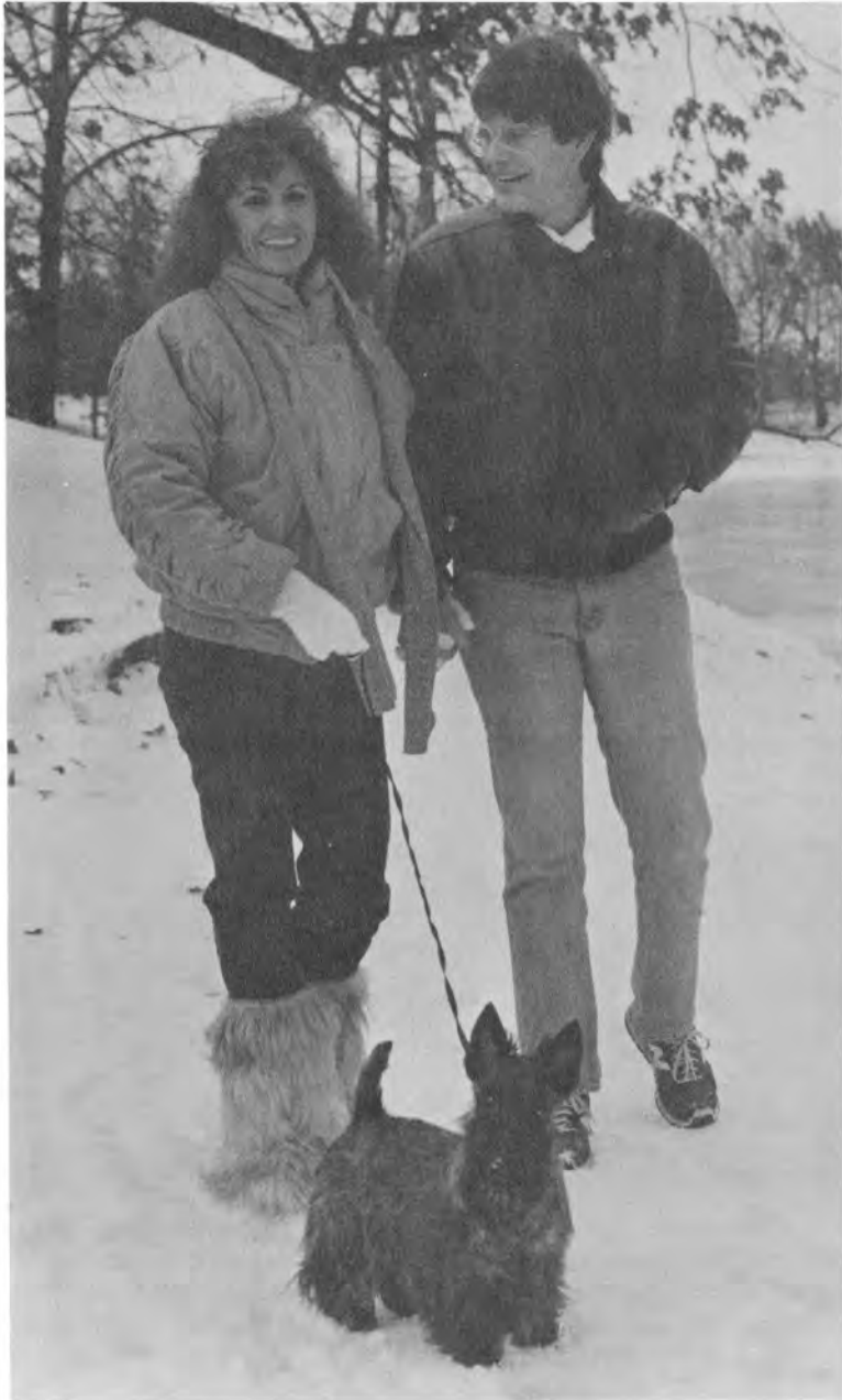
Heart to Heart in Indiana

With one little Scottie from the past, we're starting over again. Dreamers endure because they know the meaning of affairs of the Heart.