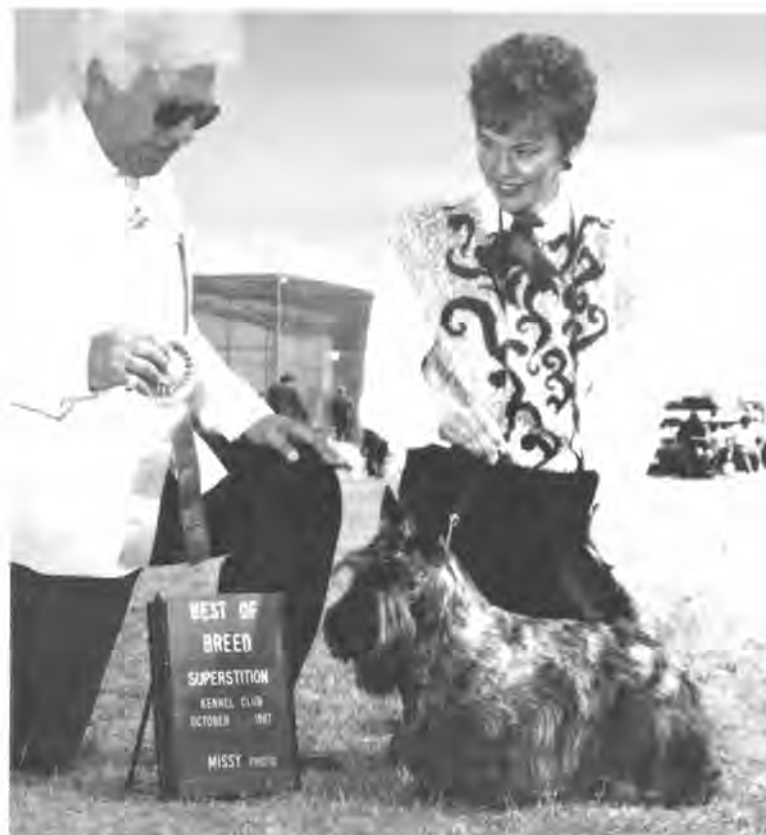
Ch. Simonsez Charlie the Charmer x Ch. Rosha's Sterling Silver

This handsome "ace" flew to a finish in just nine missions, all from the Bred by Exhibitor squadron. His initial flights included a Specialty win and second in Montgomery County Sweeps and classes. His total flight record includes four Best of Breeds and five Best of Winners. His only time out as a "General" he captured a Best of Breed. In January, he'll be a squadron commander of new recruits.