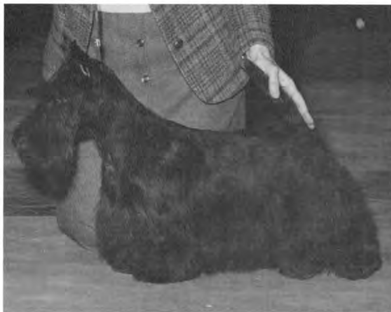
Ch. Anstamm Thanks For The Joy (Ch. Make My Day of Mayson x Anstamm Indian Summer)