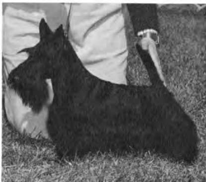
Ch. Anstamm Dakota Brave The first to leave the reservation, Dakota finished from the puppy class with a Group placement.