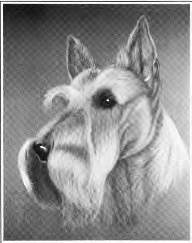
CHAMPION DANA'S GOLD COIN "PENNY" (Ch. Dana's Sunday Edition x Stirling Miss Emily)