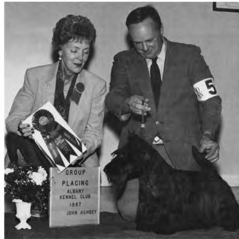
Flash A DOUBLE FEATURE — BACK TO BACK GROUP 1

A CHARTHILL PRODUCER NOW SHOWING IN GROUP RINGS AROUND THE COUNTRY