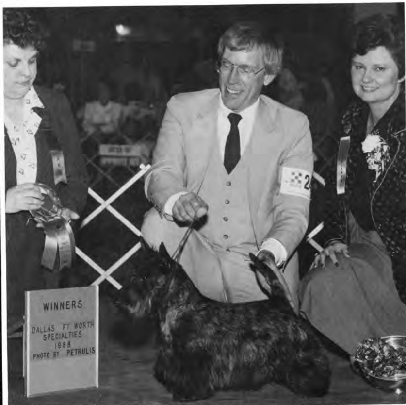
A DOUBLE FEATURE — BACK TO BACK SPECIALTY WINS