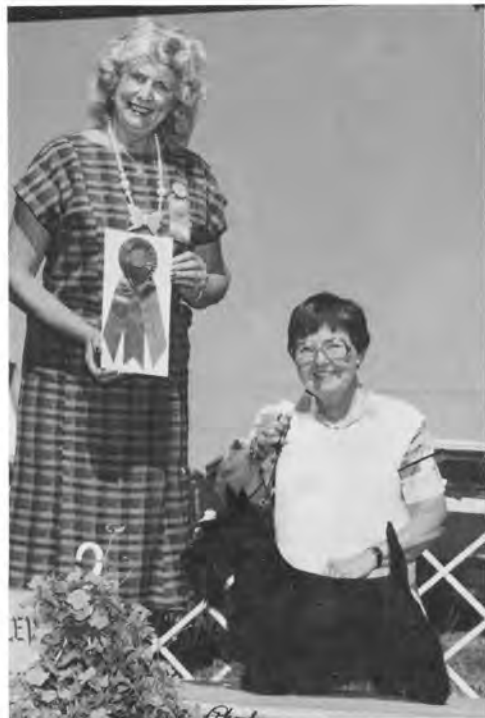
She's Number 1*

Charlotte Whittor, Former mayor, Ottawa, Canada