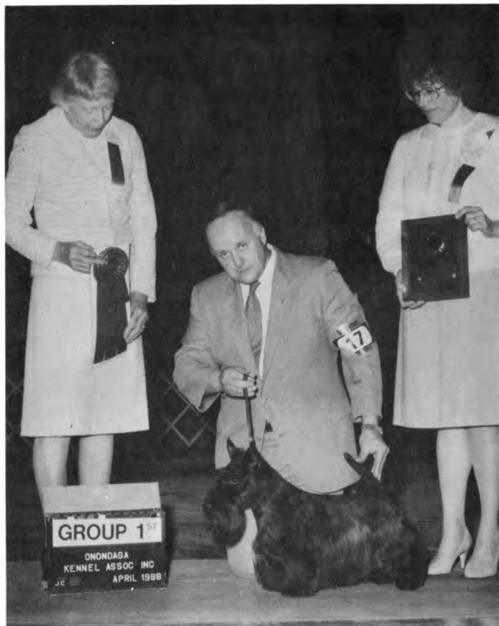
CH. CHORTHILL WORTHY OF COLWICK