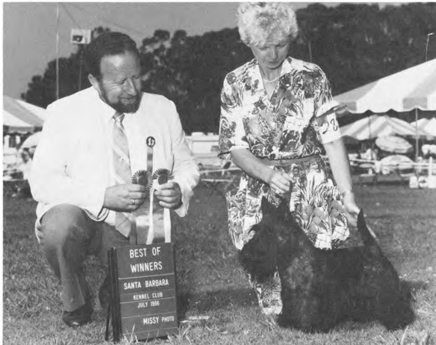
CH. REANDA SPIDER MAN

IS ALSO PROUD TO PRESENT HIS 2nd CHAMPION SON WHO FINISHED UNDEFEATED.