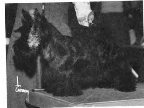
Ch. Dunbars Southern Dancer Our Foundation