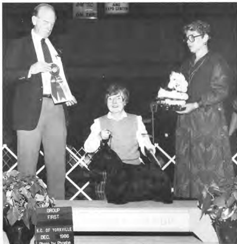
Ch. Anstamm Apache