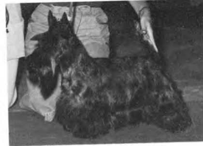
Ch. Ruffton's Dynamo Son Multiple Specialty and Group winner.