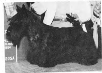
Ch. Ruffton's Regal Ruler Son Group winner.