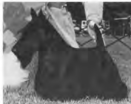
CH. ASHMOOR HUCK FINN OF GAELWYN