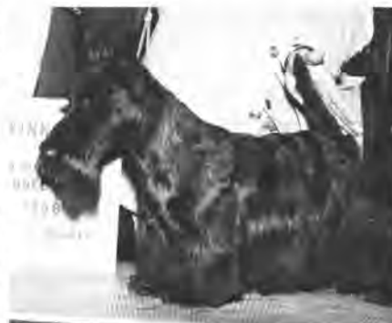
CH. MANDERLEY REBECCA