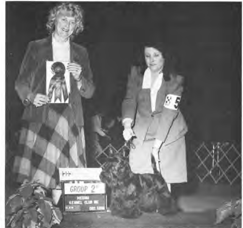
(Ch. Tandem's Hellzafire x Ch. Lochlaymen's Harvest Moon)

Only 12½ months old this young show well-balanced dog went WD-BOB over special.