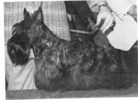
Ch. Scotsbairn's Baron Dhu Grandson Multiple Group, Specialty and BIS winner.