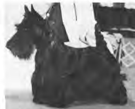
WHISKEYBAE YANKY MAGPIE (6 pts.)

Becky and Maggie reproduce the size, balance, overall quality, and high-tailed showmanship typical of Huck Finn's sons and daughters. These kids show that he reproduces himself—just incredible ear set, short back, short tail—weights fitting the American standard!