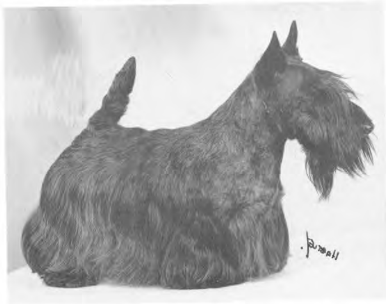
Eng Am Can Ch. Scarista's Rocky x Jenny Wren of Scarista