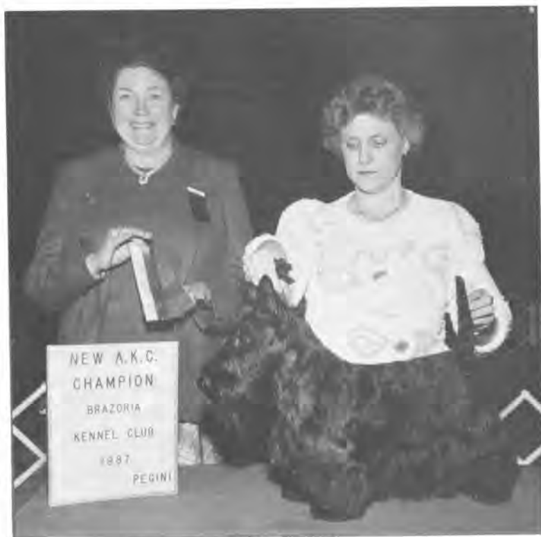
BONNIE & DONNA

→ CH. WHISKYBAE YANKY BONNIE JEAN ← CH. WHISKYBAE YANKY HIT MAN X KENNEDY'S LADY LAUREL