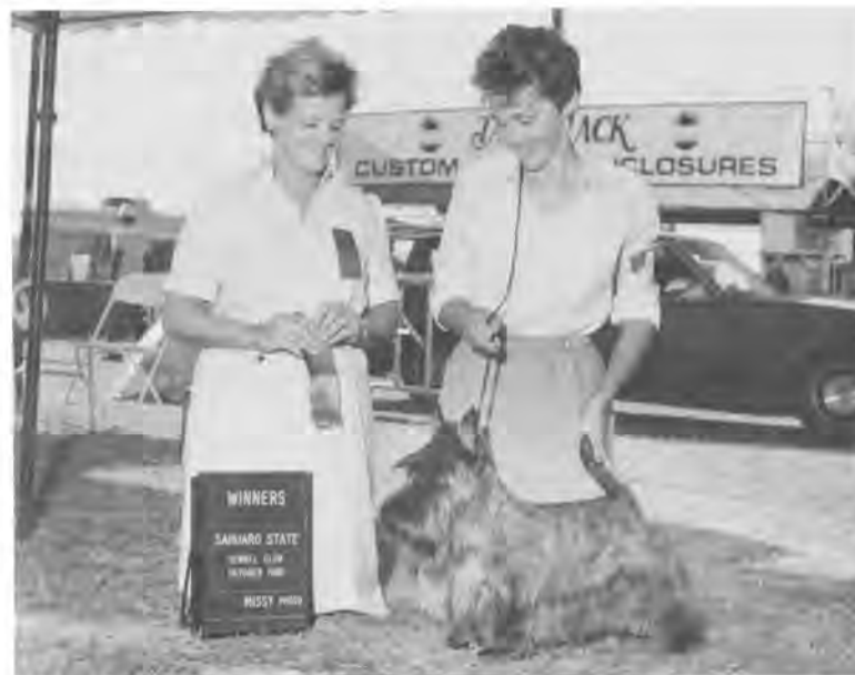
(Ch. Seaforth's Brindi Bart x Ch. Roshia's Sterling Silver)

All barrels loaded, this tough hombre finished by capturing Best of Breed for a major at Scottsdale Dog Fanciers. He is wanted for his hard coat, showiness and superb temperament. After shooting them up with 14 points from the Bred by class; he now resides on his ranch.