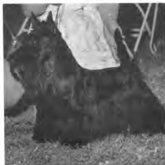
CH. GLAD MACS GINGHAM GIRL "RAZZI"