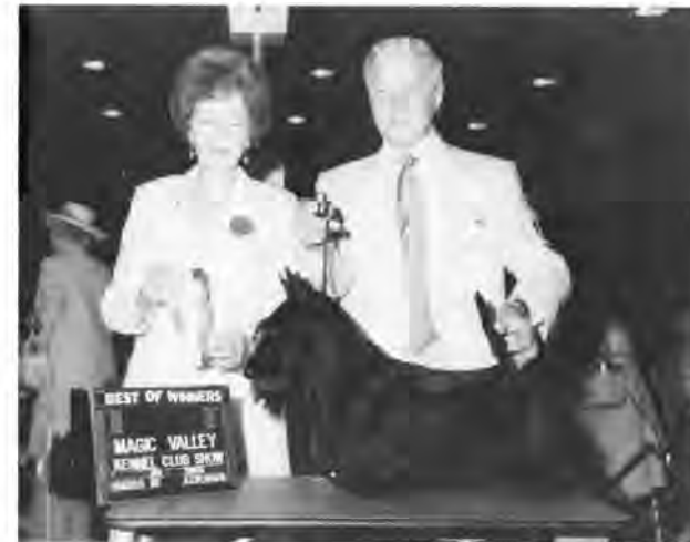
Ch. Stickler's Colonel Scott Ladd