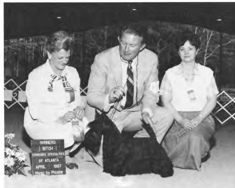
Ch. Sandgregs Journalist x Ch. Hughcrest Jigger O'Gin