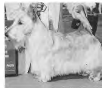
Ch. Mystigael's September Morn "AUTUMN"