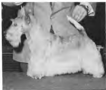
CH. SANDGREG'S DESERT FOX "ROMMEL"