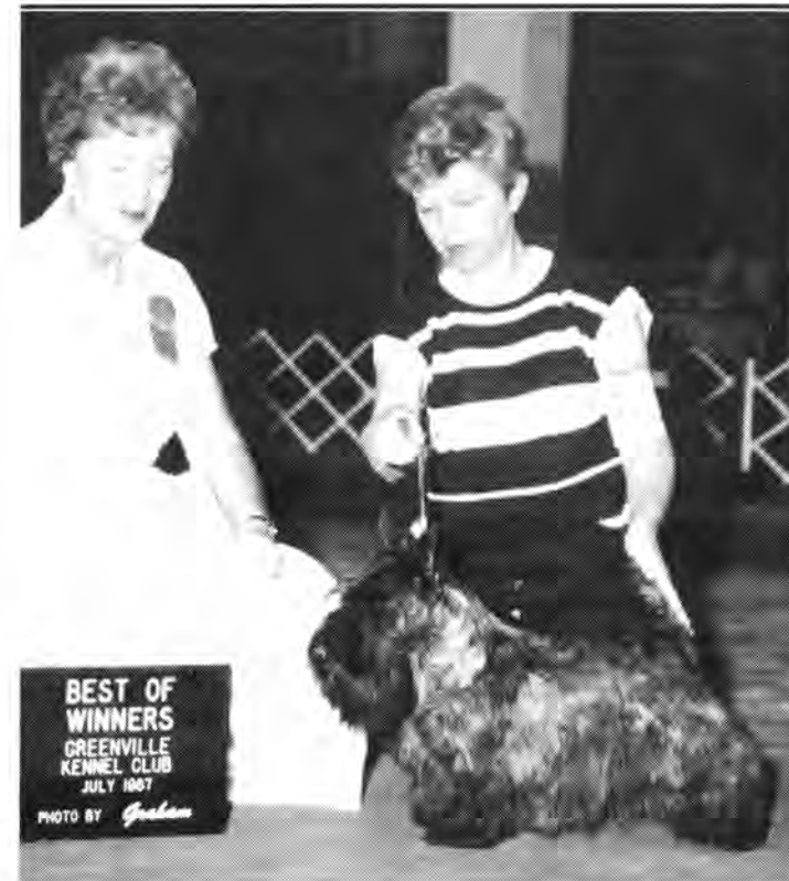
(Ch. Neidfyre Limited Edition X Ch. Breacan Naughty Enough)