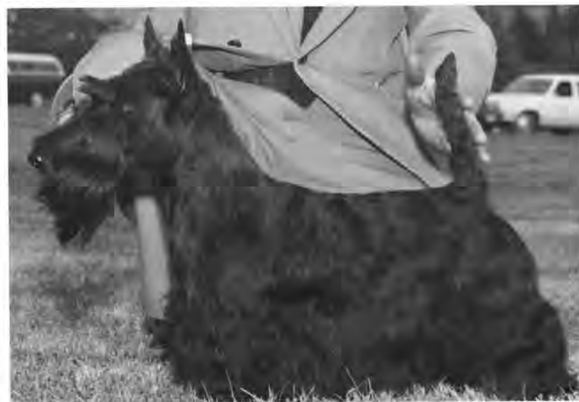
Mother of four champions

FCH., WCH., A.W.T.A. C.G. Currently working towards a C.D.