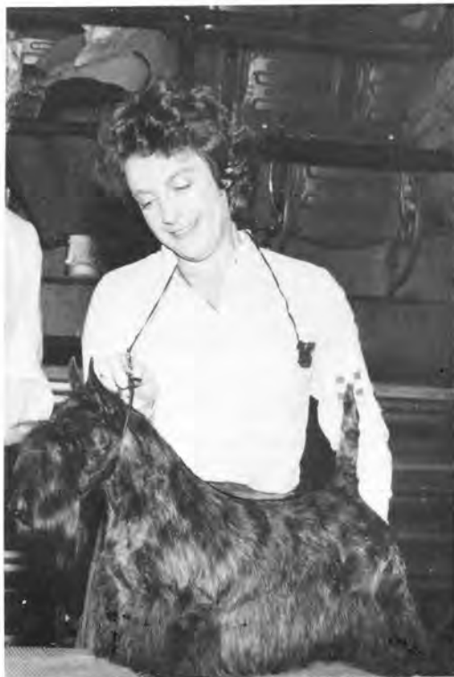
(Ch. Uncanny's Against All Odds ex. Ch. Belgair's Timely Token)