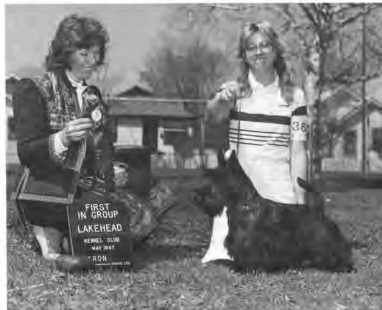
(Ch. Simonsez Charlie the Charmer x Ch. Dunbar's Emerald Exodus)

"Like Father-Like Son" is true with this young male. Breeder-owner handled, "Grizz" finished with all majors at the age of 14 months, from the Puppy and Bred By Exhibitor classes—with a quick three BOB's, and a Group II, all over Specials. He has also accumulated 6 Canadian points, including a Group I. With small ears right on top of his head, short level back, dark eye, nice hard coat, perfect bite, lots of bone, plus the true terrier temperament, who could ask for anything more?