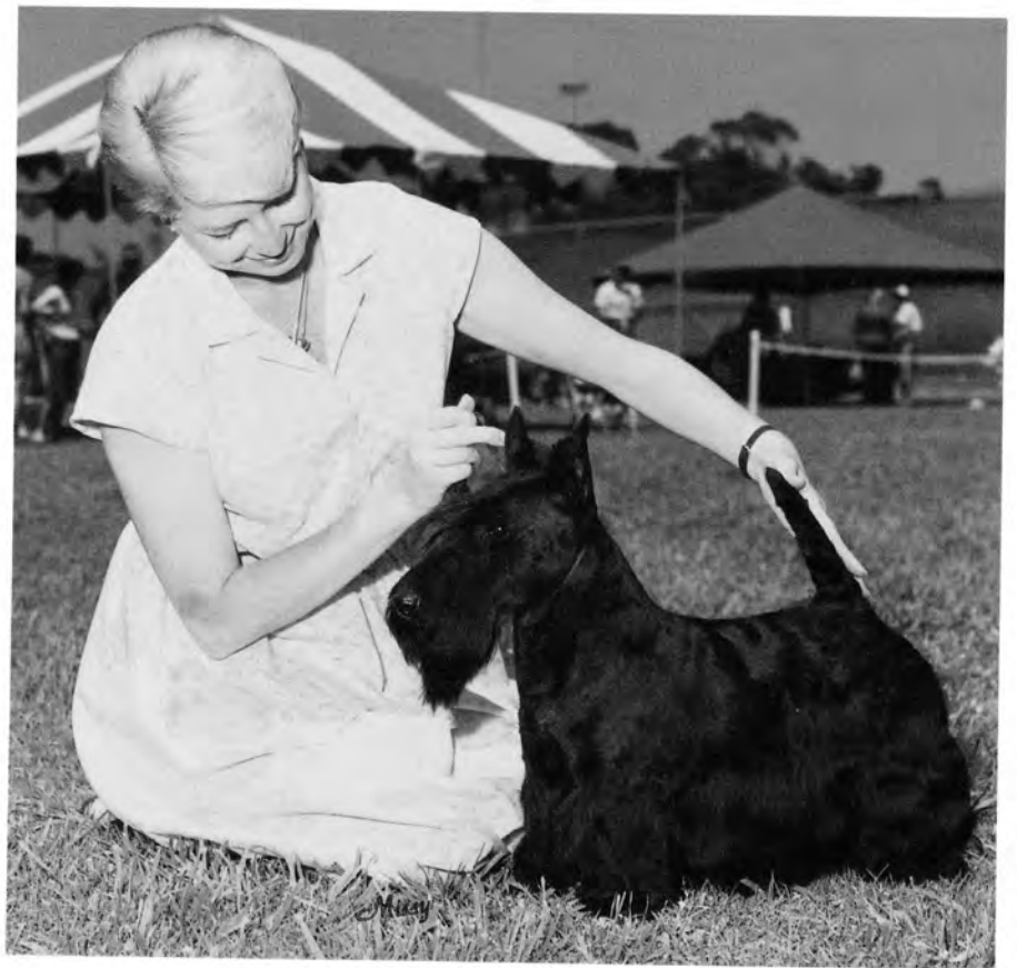
CHAMPION GAYWYN JAZZMAN "DEREK"