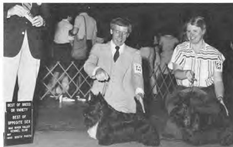
CH. CHARTHILL BARON BRIGGS