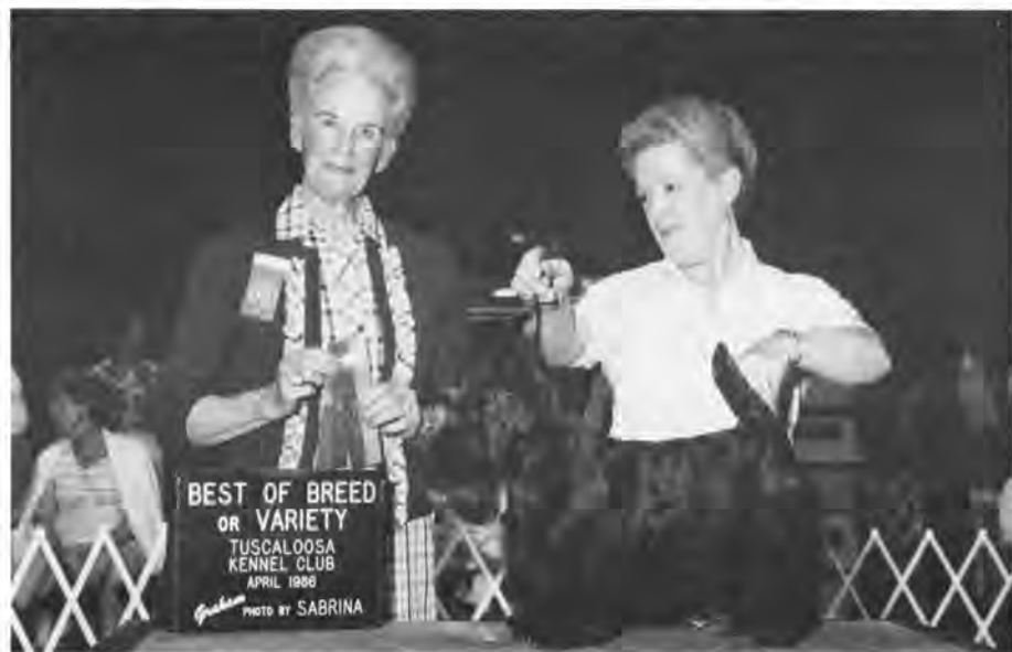
(Eng. Ch. Gaywyn Landmark X Killisport Happy Harmony)