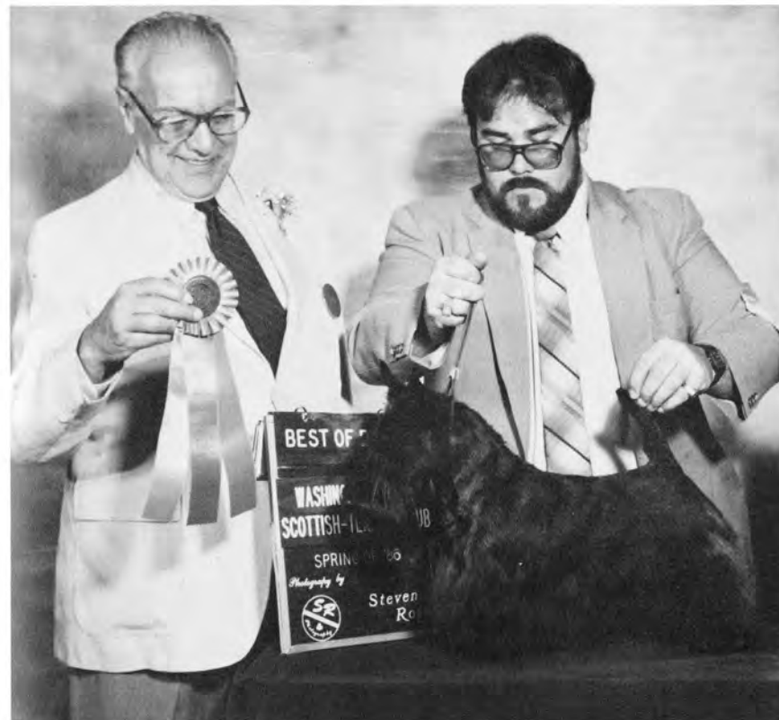
CH. BALGAIRS REDOUBT TAKE A BOW