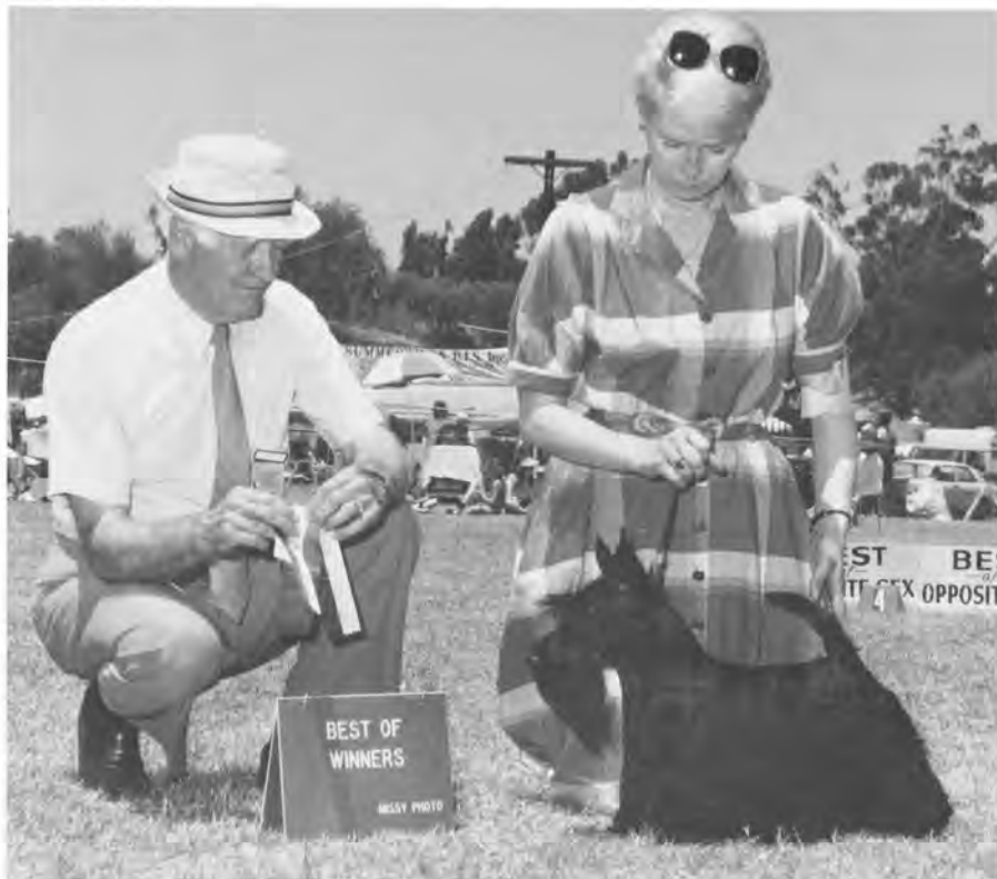
Ch. Sunrise Winwar Fantasy

This incredibly showy bitch finished with style in just 3 weekends (including a nice win the week-end of the S.F.B.S.T.C. specialty in April.) "Julie" will be bred to our import Ch. Gaywyn Jazzman this fall. We are very excited about this breeding and would welcome your inquiry.