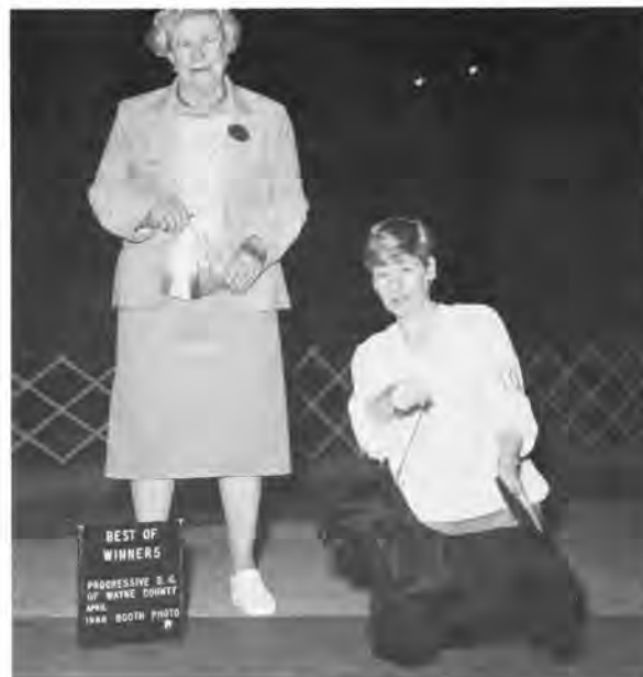
CH. WYCHWYRE HOLIDAY