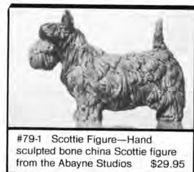
#79-1 Scottie Figure—Hand sculpted bone china Scottie figure from the Abayne Studios $29.95