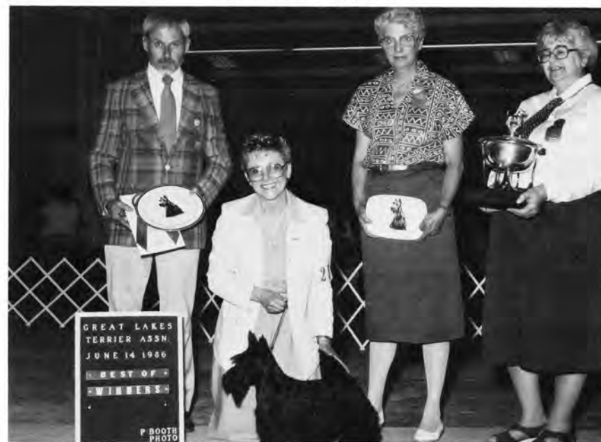
Anstamm Maid in America (Ch. Make My Day of Mayson X Anstamm Sally Forth)

At the Scottish Terrier Club of Chicago Specialty from the 9-12 puppy class.