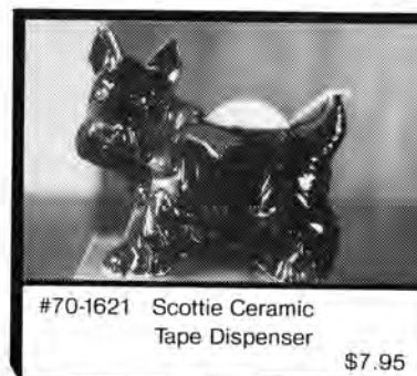
#70-1621 Scottie Ceramic Tape Dispenser $7.95