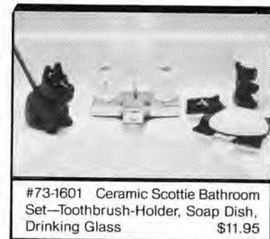
#73-1601 Ceramic Scottie Bathroom Set—Toothbrush-Holder, Soap Dish, Drinking Glass $11.95