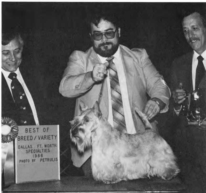
CH. SANDGREG'S SWEET LUV