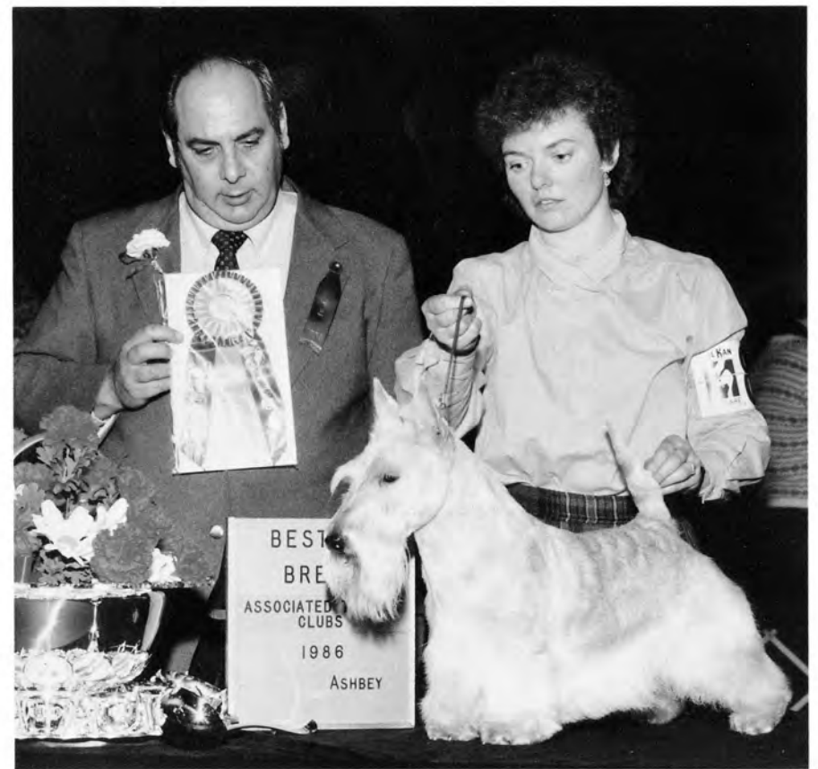
CH. SANDGREG'S FOXMOOR BEST OF BREED STCA ROTATING SPECIALTY FEBRUARY, 1986