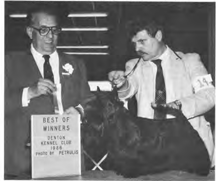
"Sandgreg's RADAR of Stalwart" sire: Ch. Anstamm Venture On dam: Ch. Sandgreg's Sexy Sadie (carries Wheaten genes)