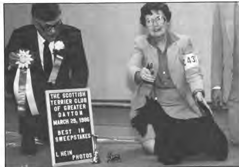
Ch. Amstamm Frisky Business

A new champion at 11 months, with 3 consecutive majors (4-5-5)