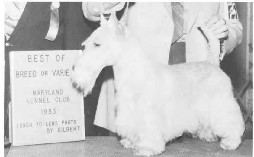
#3 JACK Ch Kenjo Gold Rush Commander, Group Placing