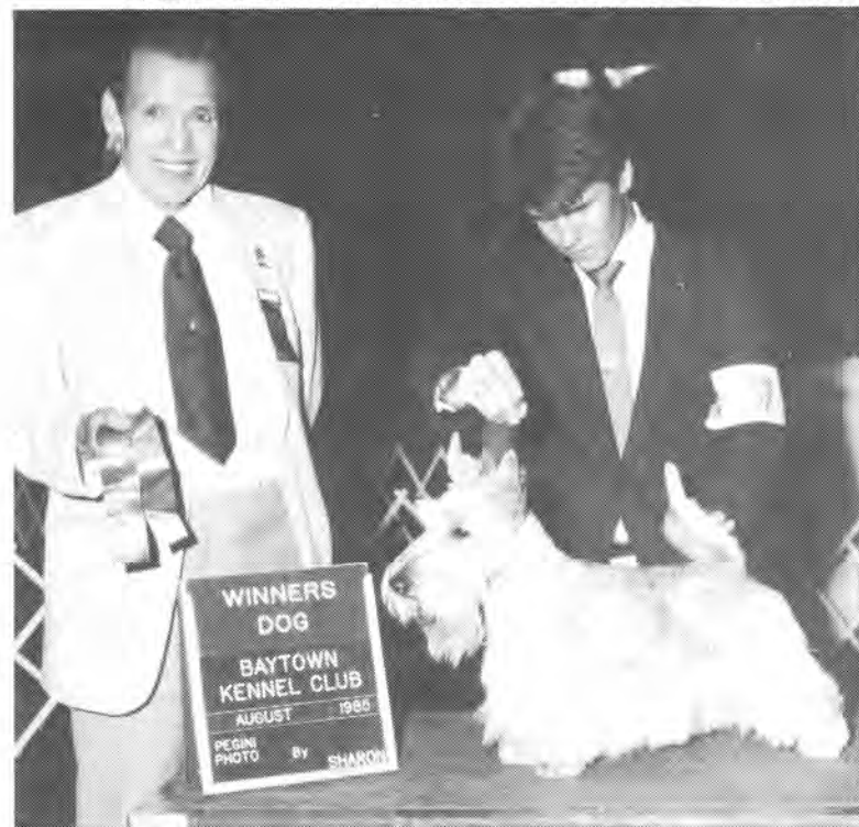
CHAMPION TINKER'S DUSTY CHIEF.

THE 5TH GENERATIONS OF WHEATEN CHAMPIONS