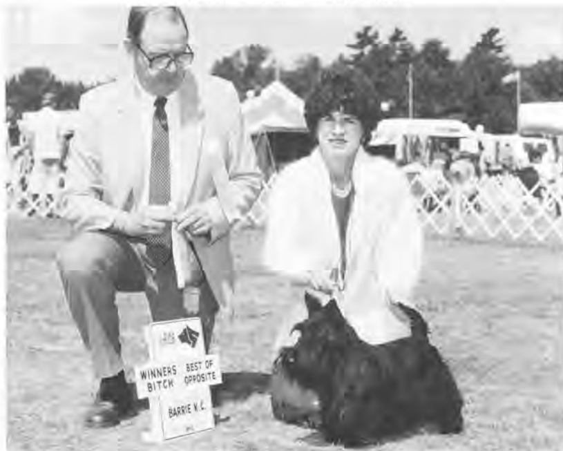
Cub's a little Mexican . . . a little Canadian But All American

"Cubby Sue" has gone international. She's crossed the border . . . north and south.