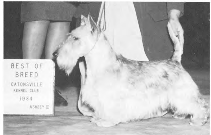
#4 RUSTY Am/Can Ch Kenjo Touch O'Gold Commander, Multiple Best in Show