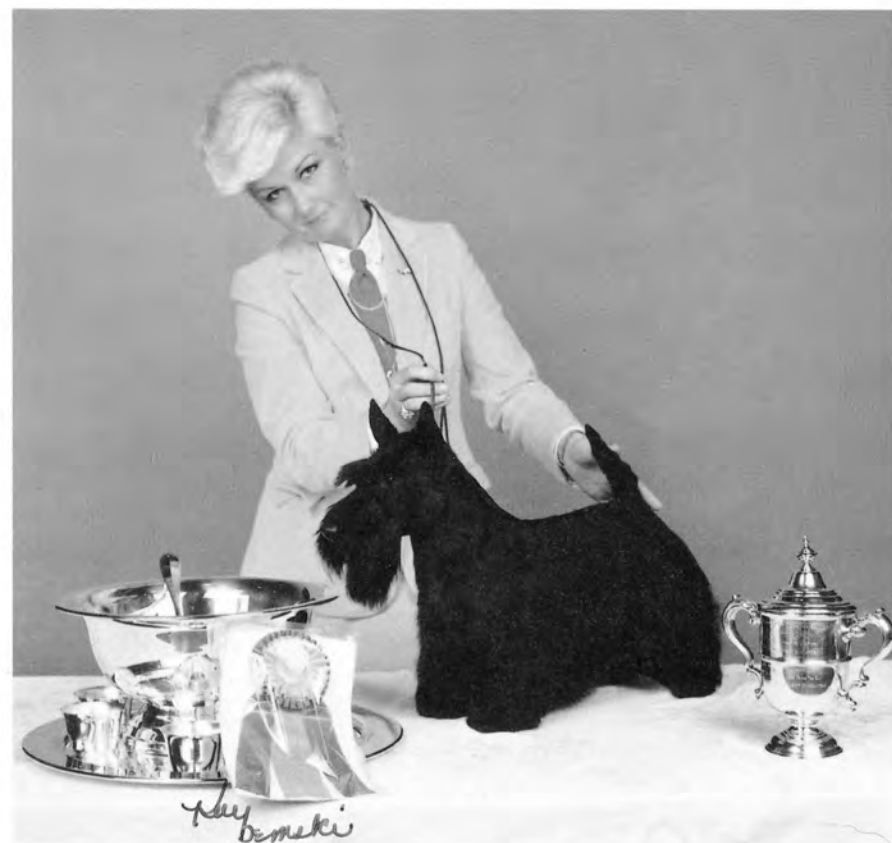
CH. HUGHCREST BOTTOMS UP BEST OF BREED STCA NATIONAL SPECIALTY MONTGOMERY COUNTY, PENNSYLVANIA OCTOBER 6, 1985