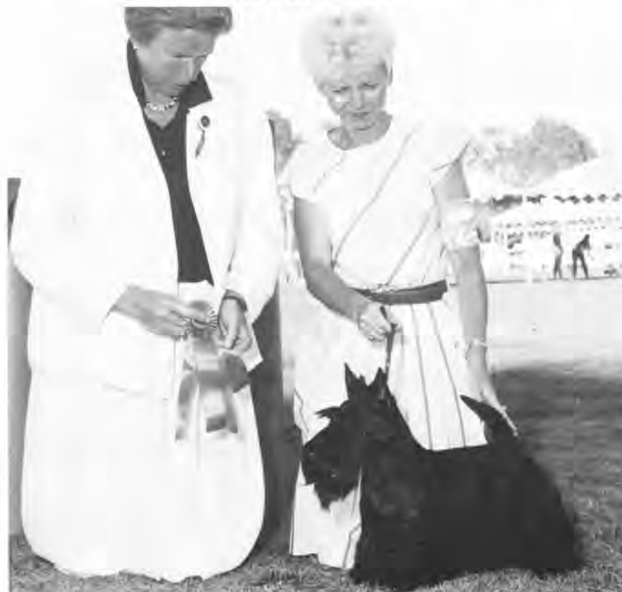
CHAMPION SANDGREG'S SWEET VICTORY CH. Sandgreg's Editorial x CH. Sandgreg's Sweet Charity