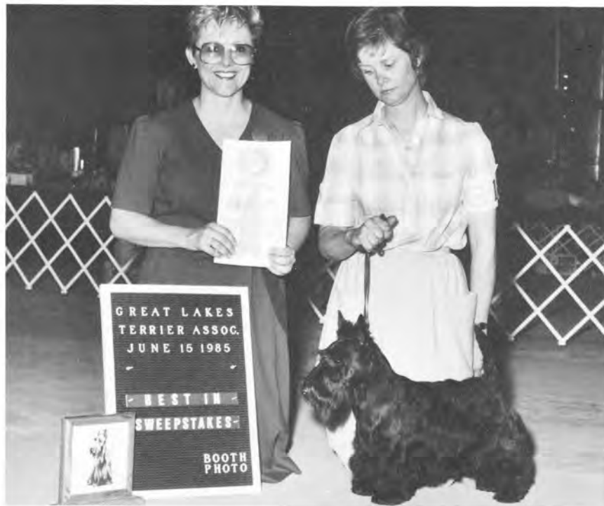
Mystigael's Knight Ryder "TUG"