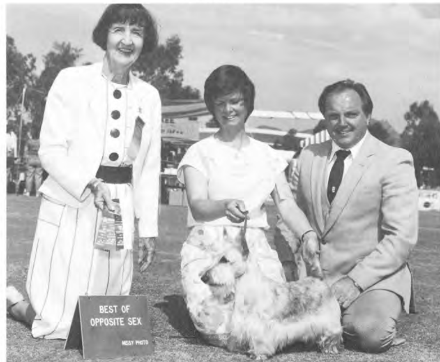
Mystigael's September Morn "Autumn"