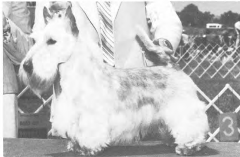
#2 JJ Ch Kenjo Gold Strike Commander