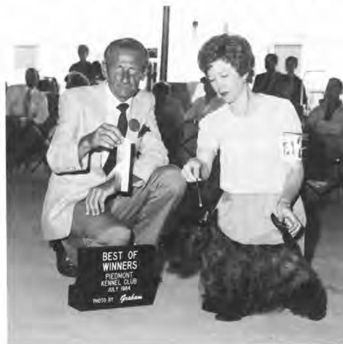
(Ch. Neidfyre Limited Edition X Ch. Balachan Look At Me)