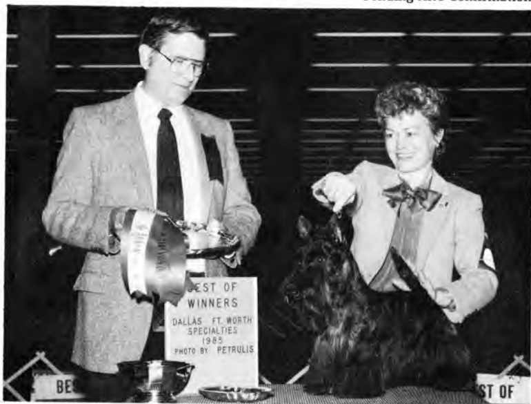
Ch. Whiskybae Yanky Hit Man (BOS - 1985 Greater New York Scottish Terrier Specialty) X Whiskybae Yanky Ginger Snap

Caevnes Kennels proudly announces that Whiskybae Yanky Stunt Man, "Eddie", completed his championship at the tender age of one year by snaring Winners Dog and Best of Winners at the Greater Dallas Specialty Show on March 22. This remarkable young dog amassed three BOB's, two BOS's and a Group III on his way to his title. Watch for Eddie, "the Stunt Man cometh . . ."