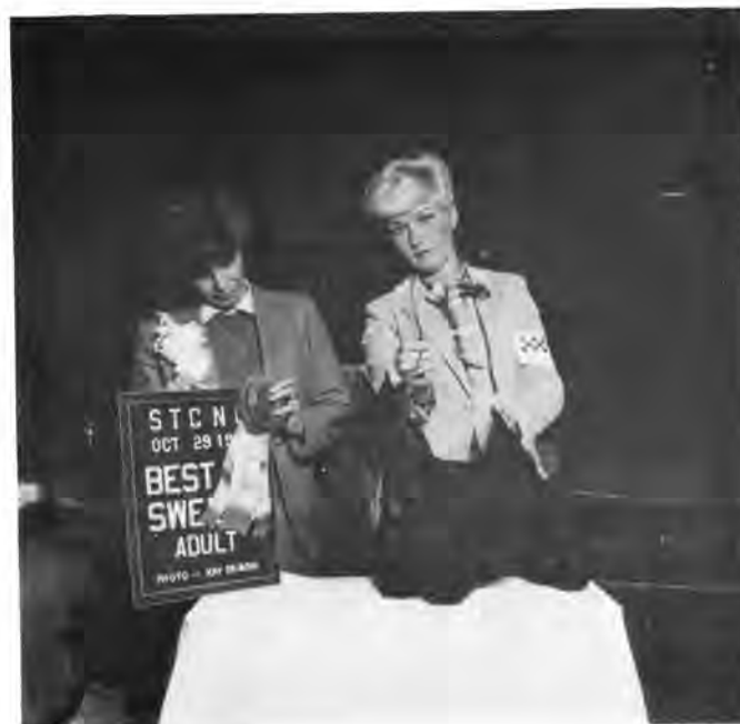
"EMILY" reflects the qualities of her breeding (CH. HUGHCREST HOME BREW x BAR-NONES' FORGET ME NOT)