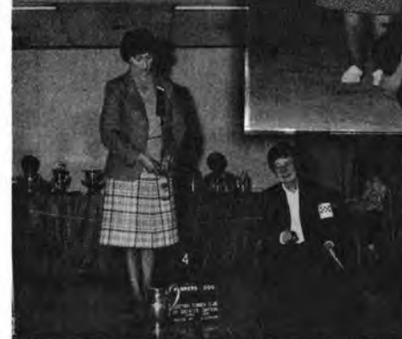
CH. ANSTAMM ON THE MARK