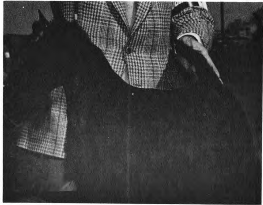
CH. REALITY TASSIE LYNN

A REPEAT OF THIS BREEDING WAS WHELPED APRIL 9, 1983, 4 BITCHES, 1 DOG. WE HAVE HIGH HOPES FOR ALL.