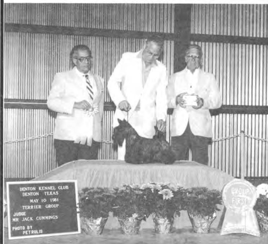
"Archie" - CH. TIDDLYMOUNT FREEMAN