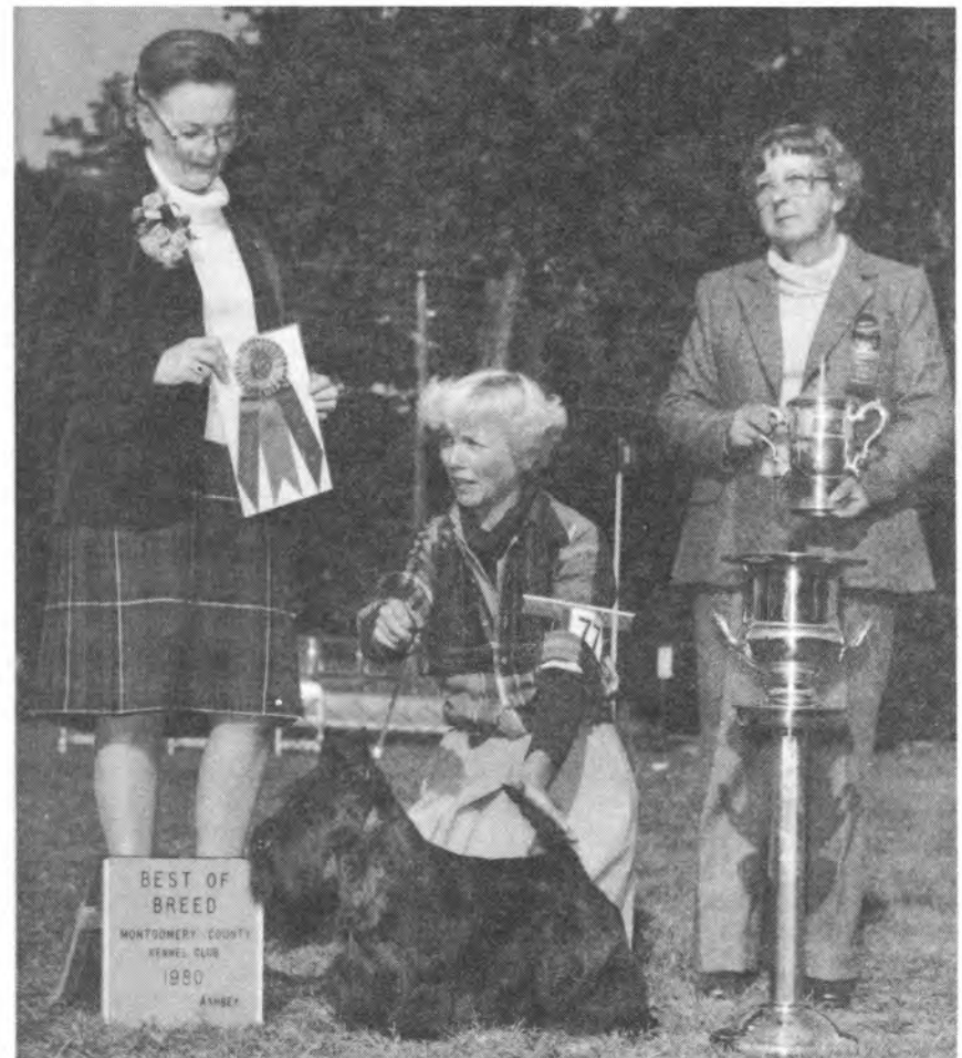
CH. DEMOCRATIC VICTORY BEST OF BREED - MONTGOMERY COUNTY